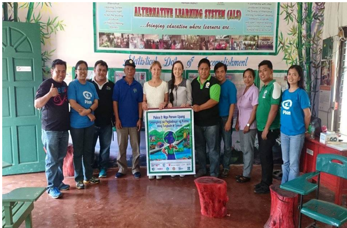
Plan International project site, Eastern Samar, Philippines