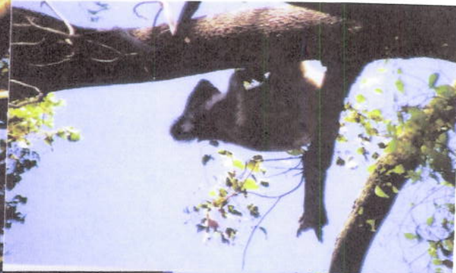
A. Koala sightings around Allen St and Tom Doherty Park since February 2011