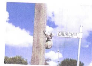
A koala at a power pole on Church Street in Acland

D. ACLAND HAS ALWAYS CARED ABOUT ITS KOALAS