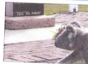
A koala visiting the Acland War Memorial grounds