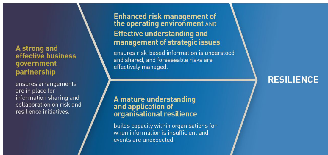
Figure 2 shows how the four outcomes work together to build overall critical infrastructure resilience

Outlined below are the four key outcomes that will be delivered through the Strategy. These outcomes will be used to assess the success of the Strategy when it is reviewed in 2020. A number of high-level activities are listed that will contribute toward each outcome, and in turn underpin the aim and objectives of the Strategy.