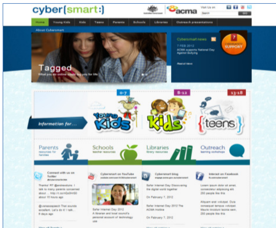
The ACMA's Cybersmart website homepage

For young people —the site provides tips and advice that reinforce positive online behaviour as well as quizzes, animations, and high-quality, interactive games. Content on sexting includes advice on the possible consequences, along with guidance on how to deal with sexting if it has got out of control.