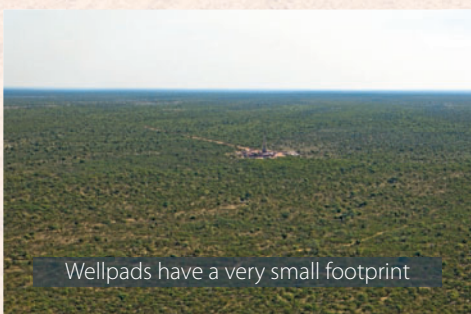
Wellpads have a very small footprint