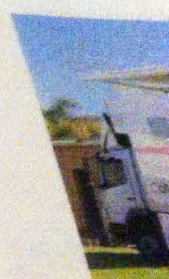
The Break from Ju...