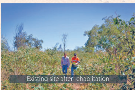
Existing site after rehabilitation

Developing a tight gas industry in WA could ensure long term energy security to WA, as well as contribute to the State’s economic prosperity and to Australia’s overall economy.