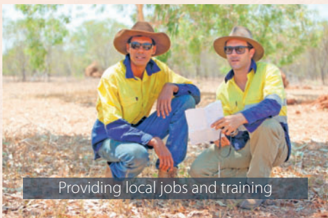
Providing local jobs and training