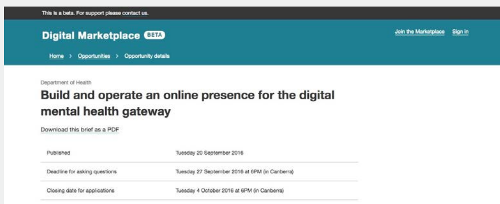
Image: Screenshot of the Digital Marketplace opportunity for the Mental Health Gateway.

The feedback from both the department and the seller has been great, with both parties enjoying a productive working relationship that has resulted in the timely design and delivery of an innovative government service that has attracted many positive reviews from its early users.