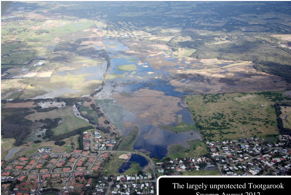
The largely unprotected Tootgarook Swamp August 2012

naturally reduce weed invasion and increase its food offering, and therefore breeding ground for all the fauna contained within the swamp. The illegal de-watering affected all of this as having occurred in spring dropping the water level over such a wide area, as Tootgarook swamp is a Shallow fresh water marsh as well as a peat regenerating wetland.