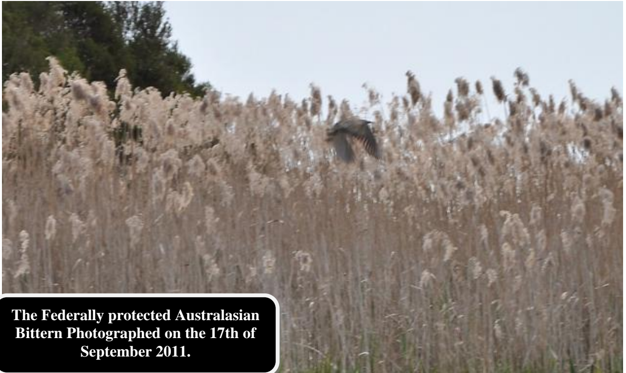
The Federally protected Australasian Bittern Photographed on the 17th of September 2011.

Why is it so hard? We have legislation, why is this legislation not followed by local and state governments? Why do ordinary citizens have to spend their hard earned dollars to keep protecting the environment if our laws are so fantastic? If we can't get these basic things right what hope do we have of protecting the critical habitat and animals.