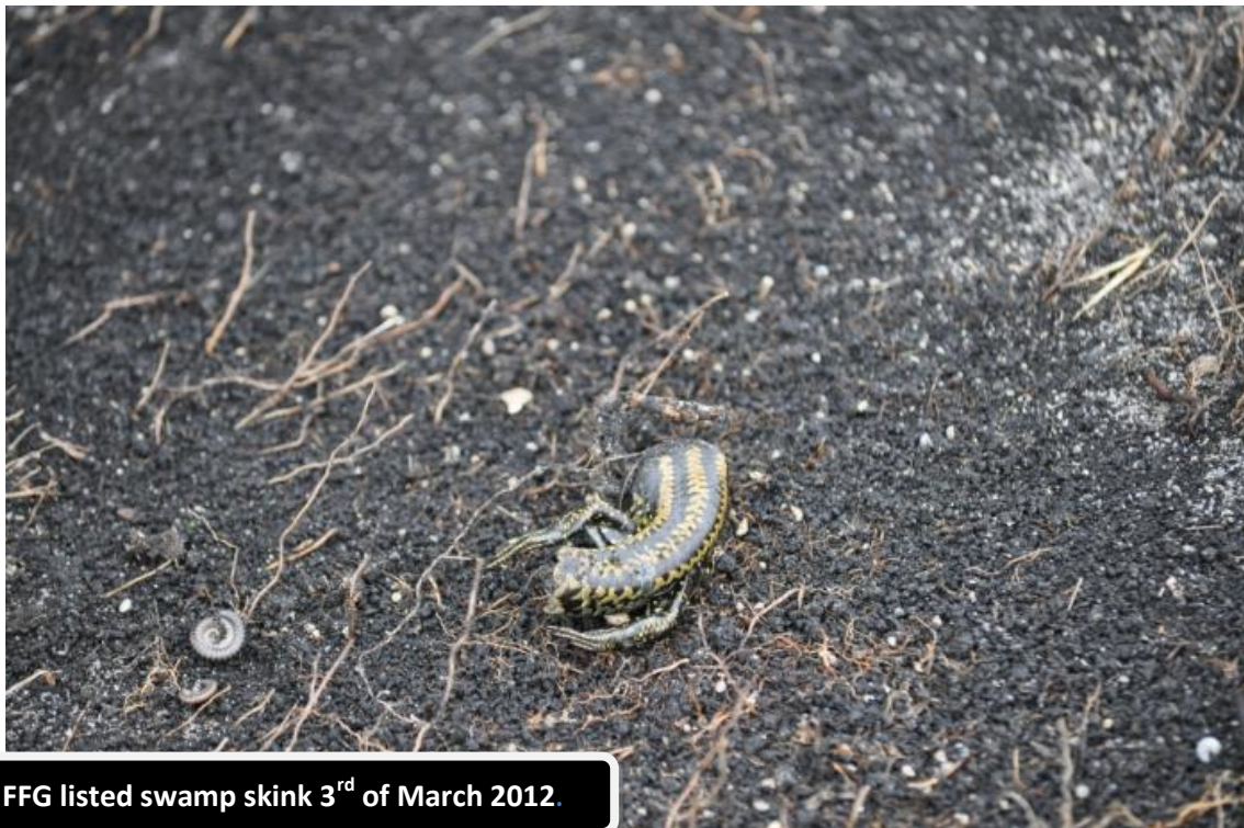
FFG listed swamp skink 3 rd of March 2012.

We say that the responsible authority illegally extended the permit by at least three years, this illegal extension, removed legalisation that would have otherwise needed to be done if a fresh permit had been applied for. Such as a cultural management plan (Victoria), a new ecology report, native vegetation offsets, department of sustainability and environment (Victoria) referral, possible EPBC (Federal) referral as Latham's Snipe had been recorded in the area. It also avoided a LSIO (Land Subject to Inundation Overlay) referral and an increased buffer zone along the creek line by another 5 meters. This avoidance we say resulted in the death of at least 5 native animals and one FFG listed swamp skink at the site.