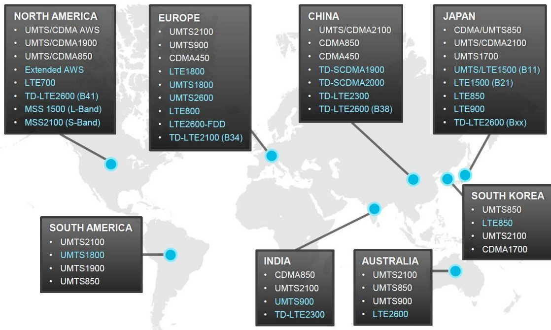
Figure 2. Global Radiofrequency Bands. 79

The technical success of this mitigation option is heavily dependent upon the availability of devices with chipsets compatible with PSAs’ networks (800 MHz and 4.9 GHz bands) and commercial network infrastructure in the geographic location where the roaming is to take place. Jurisdictions have been advised that currently one chipset vendor can provide seven different radio access modes within one device on a single chip layer which significantly reduces cost, whereas other vendors require multiple chips, increasing cost and complexity while reducing reliability.