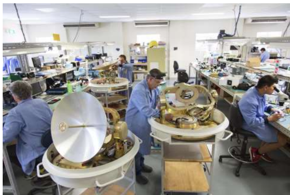
Figure 1. These figures show an example of the satellite communications on-the-move terminals designed and manufactured in Australia by EM Solutions. Similar terminals are in use in Japan, and in early July successfully passed qualification testing in Ottawa, Canada for a CDF tender demonstration. EM Solutions was unable to tender these to the ADF because the relevant procurement tender (JP2072) was bulked up to such an extent that only multinational bidders had the capability to respond. EM Solutions was a subcontractor to one prime contractor that chose, in the end, to propose a US-based solution that was viewed as more field-ready and less risky.