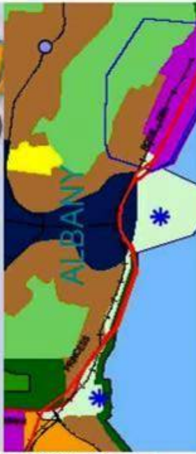
Albany LP Strategy – 2010 – Strategic Plan Urban Map 9B

In 15 years, no-one has put forward the alternative road / rail transport solution - Albany Ring Road Stage 5 (Hanrahan Road to Port), incorporating road & rail upgrades, grade separation and a slurry pipeline for the Grange Project along the waterfront - effectively, the Port of Albany will have to oppose waterfront development forever.