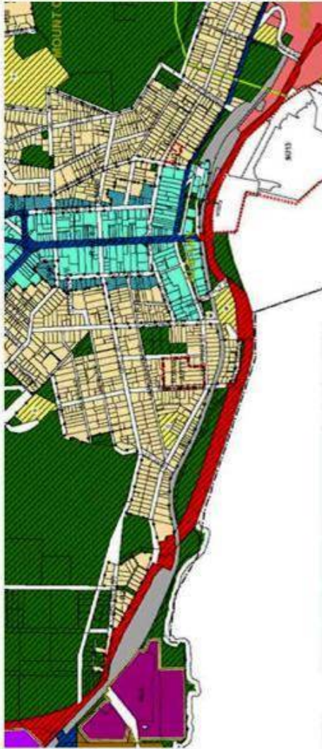
Lower GS Region Strategy – 2009 – Transport Plan