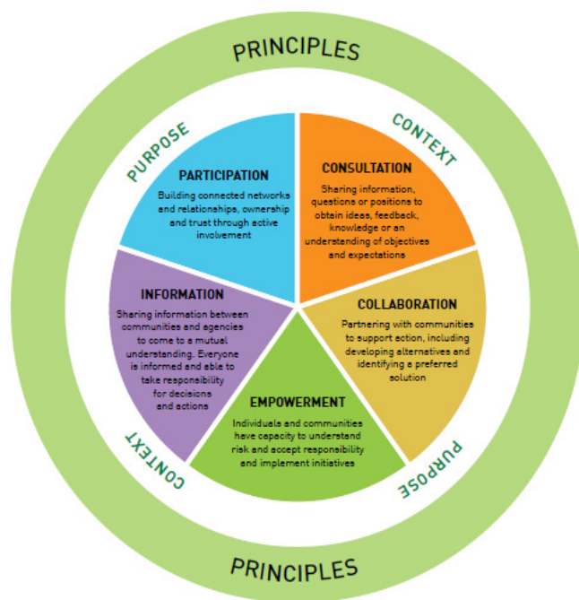
Figure 5: Community Engagement Framework

(Figure 5) provides a model that 'recognises active engagement with and empowerment of the community as central to achieving resilience over the long term'. (Attorney-General's Department: Australian Emergency Management Institute, 2013, p.3)