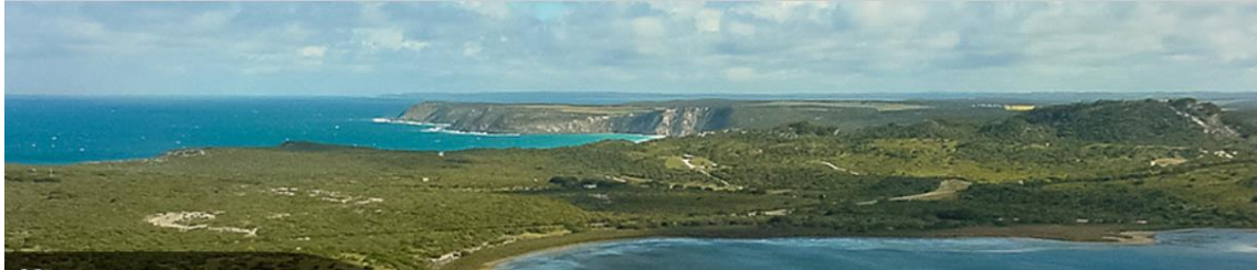
Figure 1: View of Pelican Lagoon, Prospect Hill and Pennington Bay at the connection between east and west Kangaroo Island

Similarly, the State Government establishes task forces to drive through development such as the Olympic Dam Taskforce, the Regional Mining and Infrastructure Task Force. There are even task forces to case manage development proposals such as the Golf Course and Convention Centre on Kangaroo Island which demonstrate the extent of the State Governments conflicts of interest in assessing and approving development proposals.