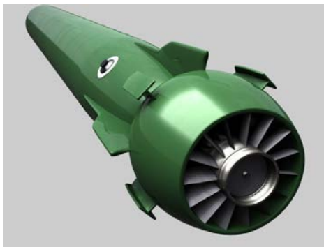
Figure 4: Pumpjet

11. All propulsion devices need to be matched and optimised to the hull with which they will operate. Many devices can be designed and tested in an 'open water' condition (i.e. without the interaction with the hull). They are then matched and optimised to the hull and operating conditions. However, pumpjets cannot be developed from open water testing. The interaction between the aft part of the submarine and the propulsor is much more important than the interaction between a propeller and the hull of a surface ship for the computation of the propulsive efficiency. Pumpjet design is fully integrated with hull form design to optimise performance.