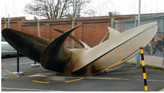
Figure 1: Submarine Propeller