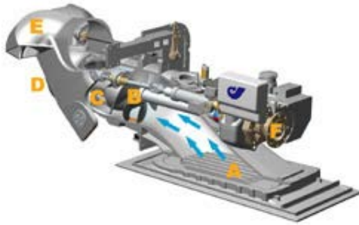
Figure 3: Water jet (Hamilton Waterjets)