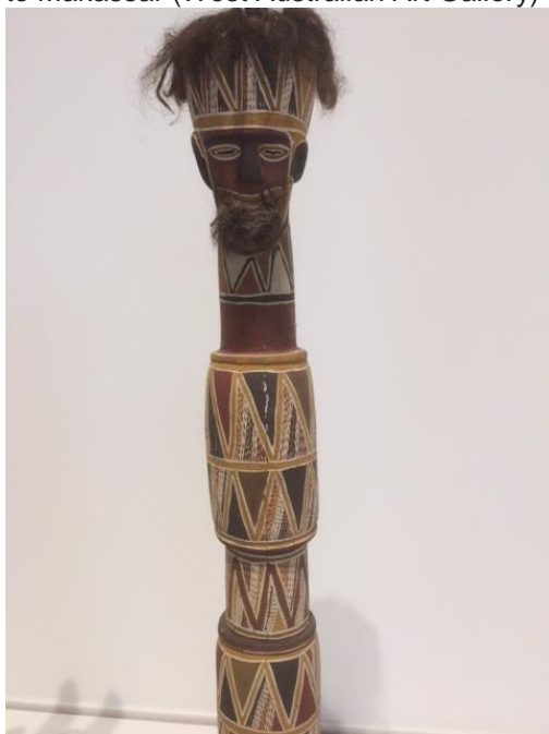
Artist: Ngulburai born Elcho Island NT 1920

North Australian Warumu post derived from Makassan funerary post after trading links North Australia to Makassar (West Australian Art Gallery)