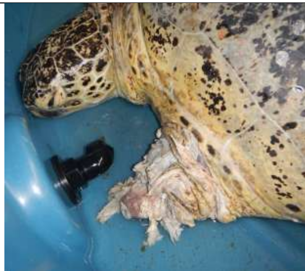
The extent of the damage caused by entanglement in the fishing line.