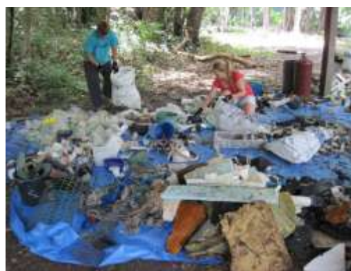
Marine debris collected from Grimston Point.