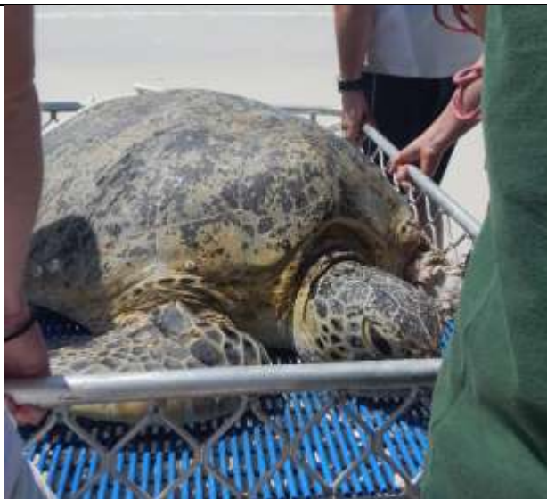
Green turtle being rescued from Whitehaven Beach.