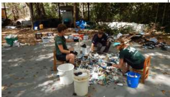
Marine debris collected from South Molle Island.

An important part of the Whitsunday Marine Debris Removal Program has been to weigh, sort, count and record the collected debris; Eco Barge Clean Seas have been a major contributor to the Australian Marine Debris Database, providing data on the debris that we have collected in our region. The most commonly collected items from the Whitsunday Region are bottle tops, plastic drinking bottles, bleach/cleaner bottles, polystyrene foam and rope. In line with the CSIRO data, most of the debris is plastic. In particular, the top two items (bottle tops and plastic beverage bottles) alone can account for up to 48% of all categorised items in the beach collections. Reducing the careless disposal of these two items would therefore dramatically decrease the amount of debris in the marine environment.