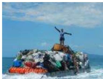
Marine debris collected from 10 beaches on the 2014 four-day Expedition to the southern Whitsunday Islands