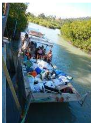
A typical load of marine debris from a day trip to the Whitsunday Islands