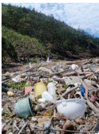
A highly impacted beach in the Whitsunday Islands

The Whitsunday Marine Debris Removal Program was originally launched in June 2009 and to date has been responsible for removing over 130,000 kilograms of marine debris from the Whitsunday Region. This has made a huge difference to the Whitsunday Islands and the marine life that call this region home, but having dealt with much of the accumulated debris, we have found that the marine debris continues to arrive in the south-east trade winds, at some locations at rates in excess of 2 kilograms per day. As more debris arrives on the windward facing islands, approximately 40 maintenance clean-up trips per year are required to prevent it from accumulating again. Most of these trips are simple day trips, but to reach the highly impacted southern island group, an annual expedition is required, staying for 4 nights on Lindeman Island; the first of these trips yielded 2.7 tonnes of marine debris from just 10 beaches!