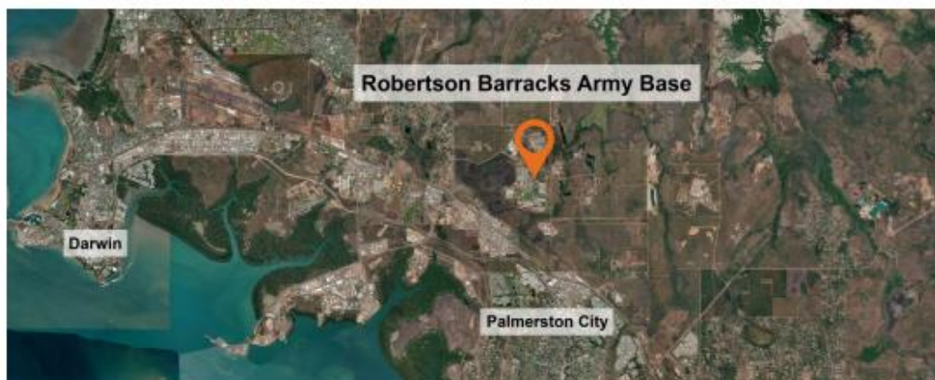
Location of Robertson Barracks

The Robertson Barracks Base Improvements Project aims to provide essential upgrades to facilities and infrastructure to support the Australian Defence Force and allied partners. When completed, the Project will provide Robertson Barracks with new living-in accommodation, increased messing capacity, as well as upgraded water and electrical infrastructure.