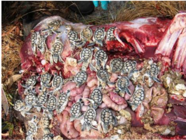
Figure 4. Photo showing an autopsy of a feral pig that had been preying on marine turtle hatchlings in north Queensland. The photo shows at least 32 hatchlings from one feral pig.

Despite these widely understood shortcomings the current Feral Pig Threat Abatement Plan has included “A reduction in feral pig populations as a proxy for reduced environment damage” as a marker of success. Best practice dictated that the only effective measure of success is the recovery of measured threatened species. While this is a more expensive option it is, at the end of the day, the outcome that matters.