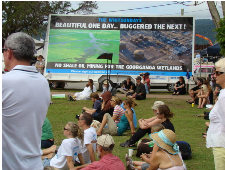
SOF & Greenpeace Public Meeting 2008, with mobile campaign billboard. Slogan "Beautiful One Day Bugged The Next" is a registered trademark

This proposal should never have been considered given the known disastrous and deadly pollution from the first failed plant near Gladstone.