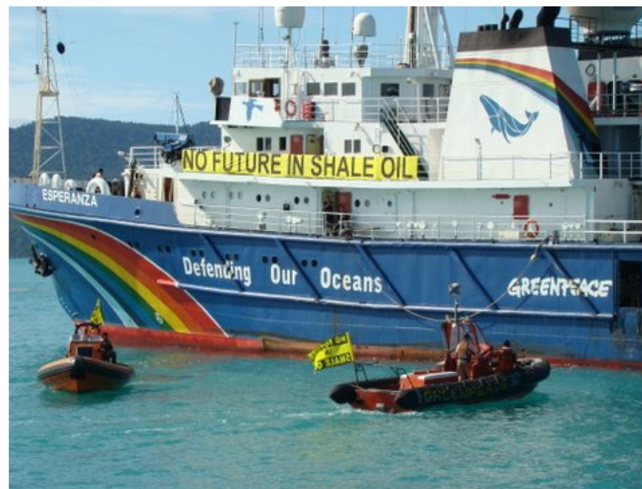
Greenpeace in the Whitsundays to protest proposed Shale Oil Mining & Processing Plant