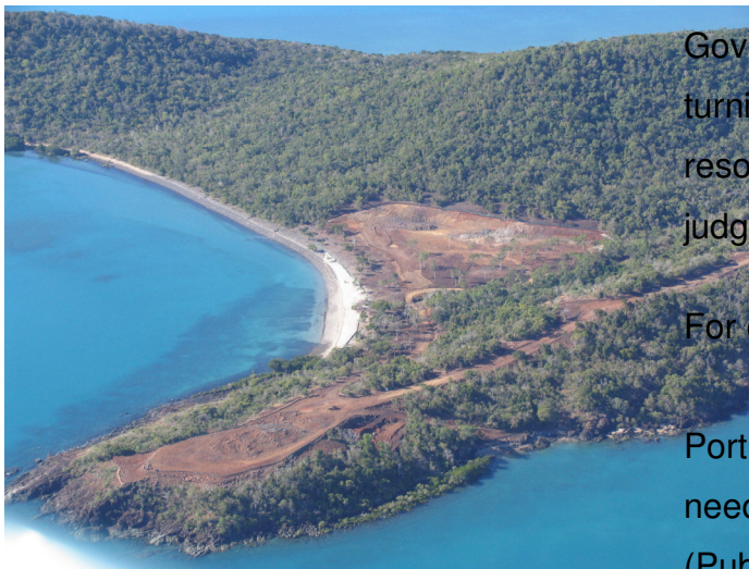
13 hec (of 387 hec) illegal clearing including endangered remnant coastal forest, Dryander National Park and into waters of GBRMP at Clarke's Cove 2008, developer prosecuted but the damage has been done.

There can be no doubt that failed development control plans are a significant contributing factor.