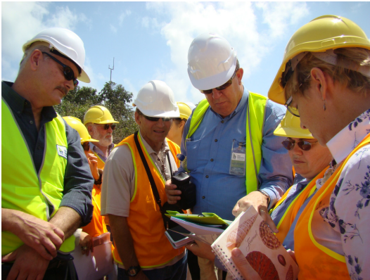
Abbot Pt expansion briefing

Caley Valley Wetlands, Abbot Pt, site adjacent to proposed Alumina Refinery. Caustic “red mud’ is a by-product and a disaster such as occurred in Hungary when a red mud dam broke are a potential risk here too, on the wetlands and adjacent to the GBRWHA.