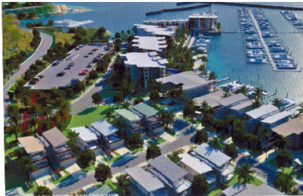
Shute Harbour Marina concept (from EIS)

The E3Planning report notes that this is an unsustainable way to provide housing. On evidence, this proposal fails the social, economic and environmental test and we ask it is highlighted as an example of the critical need for URGENT Legislative Reform