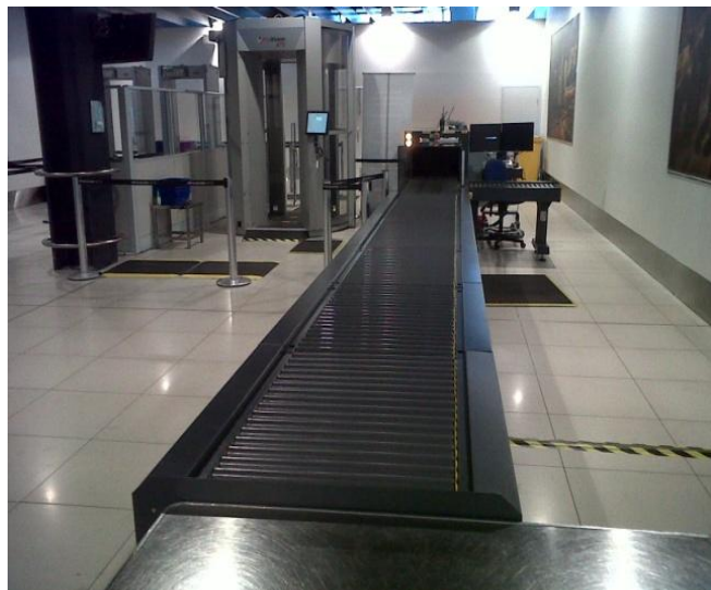
The trial lane at Melbourne Airport.

Passengers waiting in the main queue were asked if they would like to volunteer to participate in the trial. Volunteers were directed to the trial lane where they were randomly selected to go through the body scanner. Volunteers with metal joints, pacemakers and other metallic implants that make it difficult for them to be screened by a walk-through metal detector were also allowed to opt in for body scanner screening. Those not selected for the body scanner proceeded through the walk-through metal detector in line with current procedures. Every volunteer's carry-on baggage was screened by the multi-view X-ray equipment. Volunteers were then randomly selected to undergo explosive trace detection screening.