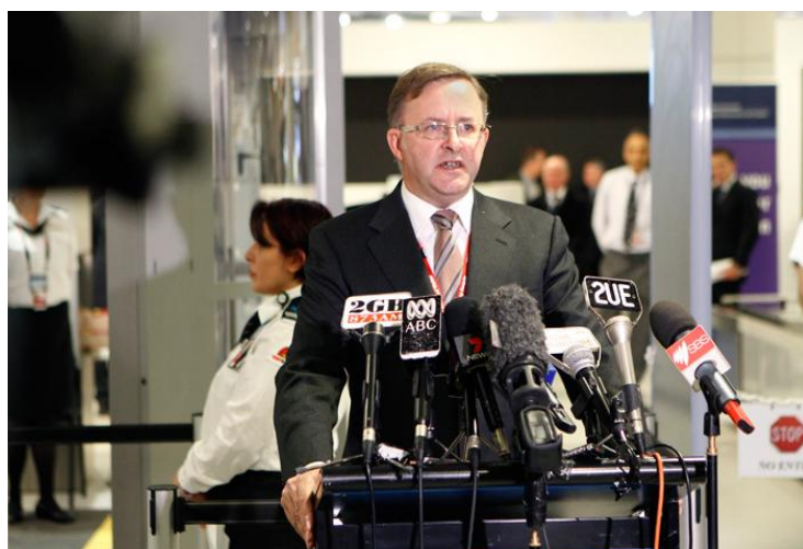
The Hon Anthony Albanese MP, Minister for Infrastructure and Transport, launching the trial at Sydney Airport.

The Department conducted a media launch at Sydney Airport on 1 August 2011 with the Honourable Anthony Albanese, Minister for Infrastructure and Transport, in attendance. Invited media were given the opportunity to view the body scanner in operation and ask questions about the technology. A webpage was established on the Department's 'TravelSECURE' website for the travelling public, providing general information about the trial and specific information regarding the use of body scanners. The website included fact sheets and answers to frequently asked questions, as well as details