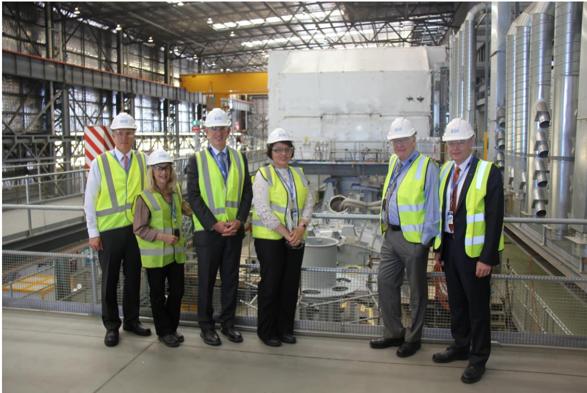
Joint Standing Committee on Treaties site visit to ASC North in Adelaide, 8 March 2017. Left to right: Mr Josh Wilson MP, Ms Nola Marino MP, the Hon Stuart Robert MP (Chair), Senator Kimberley Kitching, Senator the Hon Ian Macdonald, Senator David Fawcett.