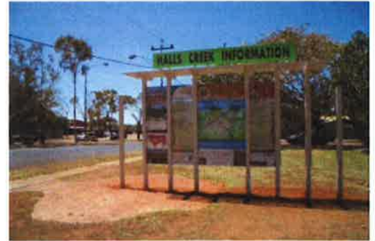
Halls Creek is a small town in the central Kimberley with a largely Aboriginal population.