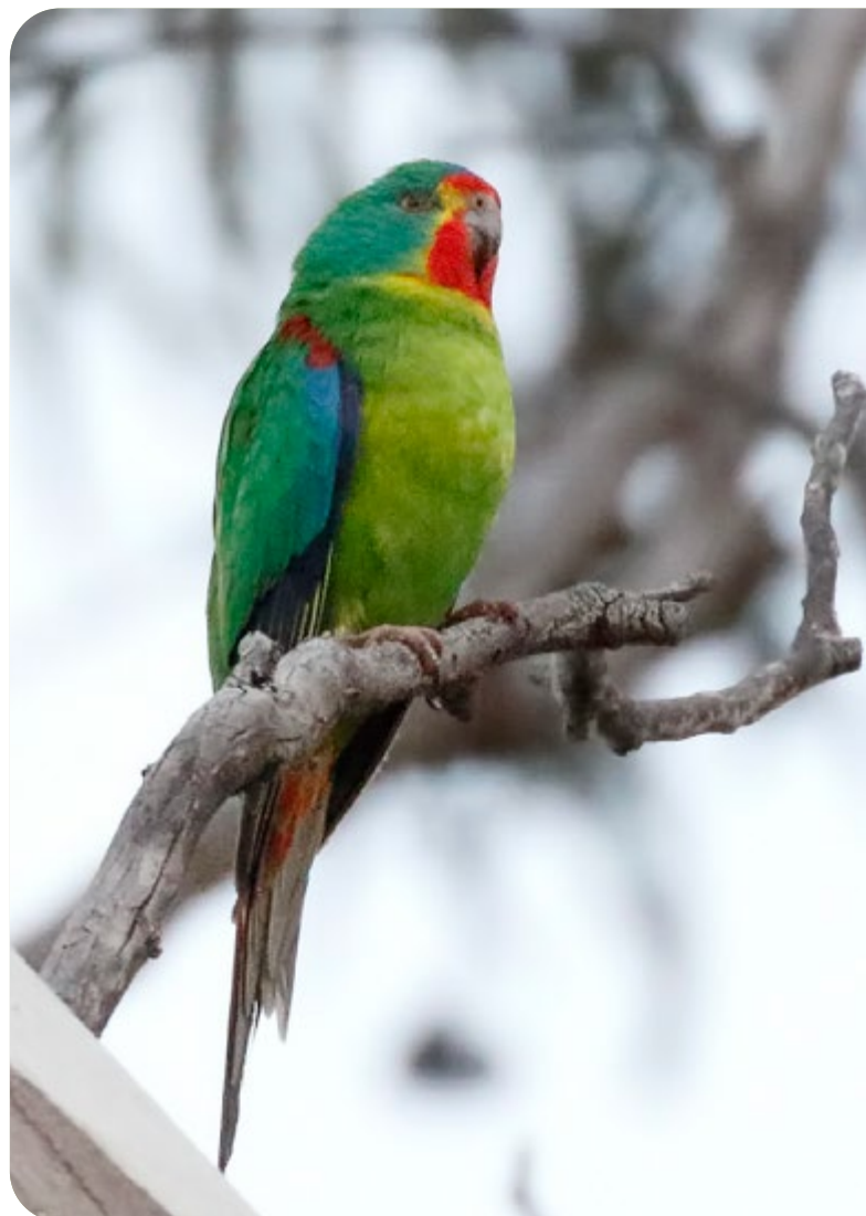
Swift Parrot.