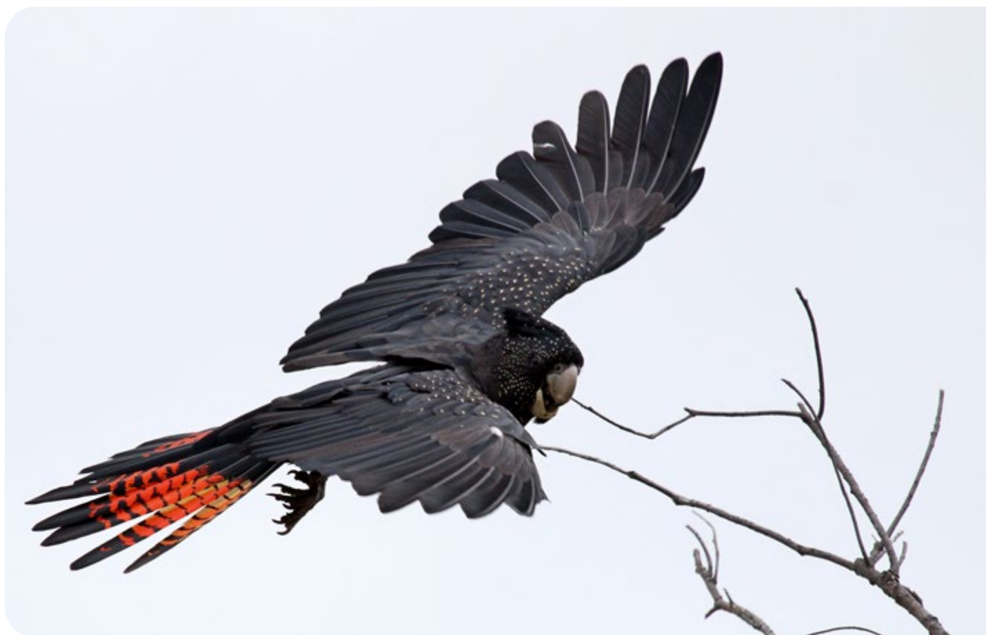
Red Tailed Black Cockatoo.

This case study demonstrates serious issues relating to state impacts on matters of national environmental significance, ineffective federal oversight, state level conflicts of interest, access to information barriers, and the use of strategic assessments as an excuse not to address individual action impacts.