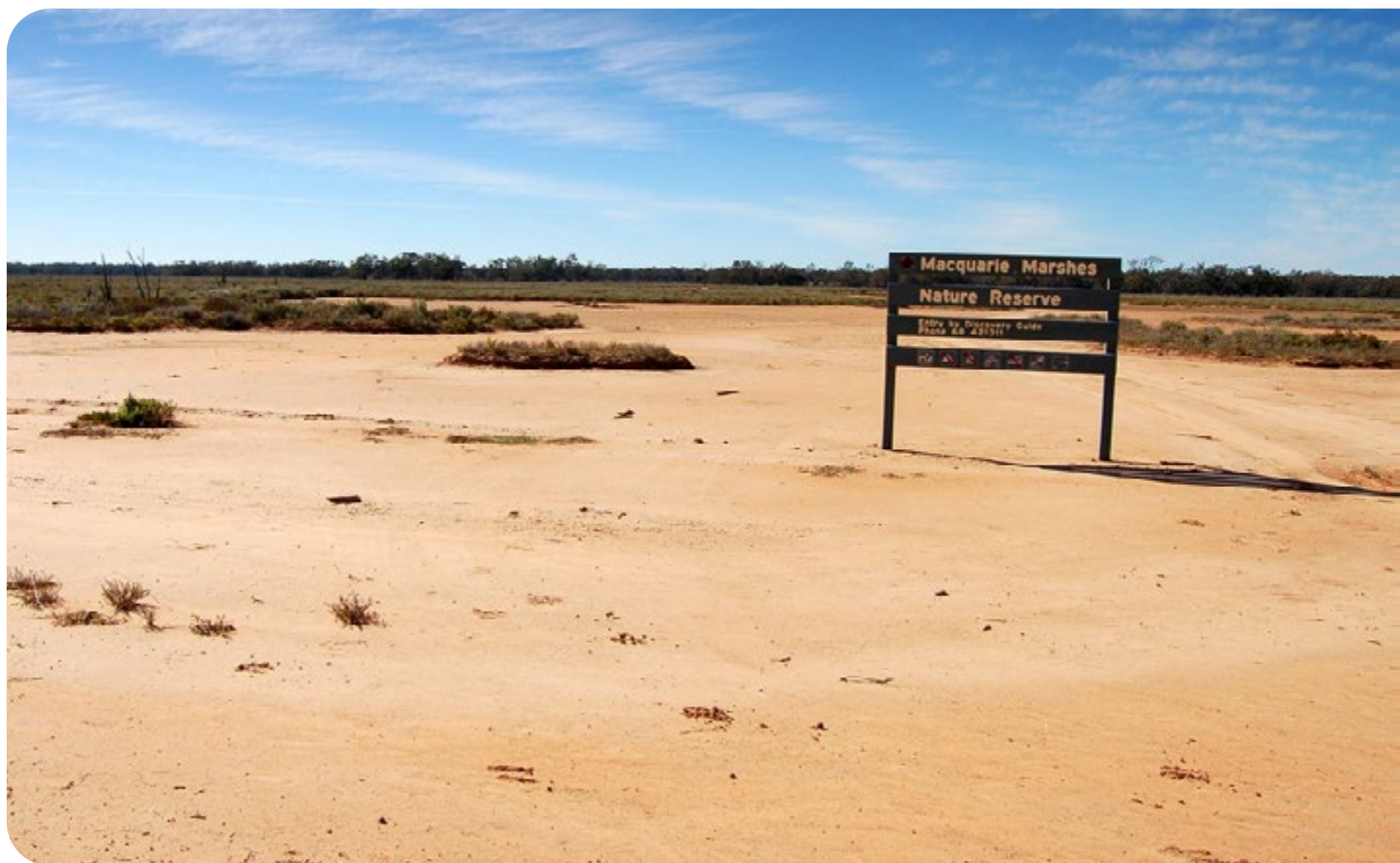
Macquarie Marshes erosion, July 2008.

This case study demonstrates that problems arise when the assessor, i.e. the NSW Government, is also the project proponent, i.e. WaterNSW, and thus Commonwealth oversight is essential to adequately assess the environmental impacts of proposed development.