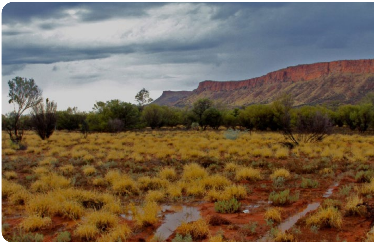
Northern Territory, landscape after rain, Environmental Defender's Office.

It is extraordinary that clearing of this scale was not referred to the Commonwealth and did not trigger the EPBC Act. This case study demonstrates the sheer scale of what can be approved by a territory government without adequate environmental impact assessment.