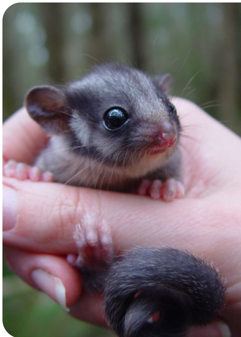
Leadbeater's Possum.

The Friends alleged that VicForests logging operations in Victoria's Central Highlands failed to comply with Victorian timber harvesting regulations, and that this failure meant that the exemption from the usual EPBC Act protections did not apply. They further claimed that VicForests logging operations did not comply with the EPBC Act and that past and planned logging has had and will continue have a significant impact on the Leadbeater's Possum and Greater Glider.