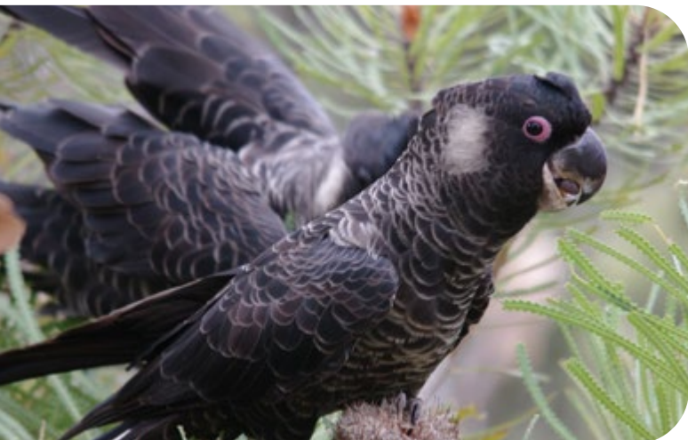
Carnaby's black cockatoo.

Carnaby's Black-Cockatoo is federally listed as Endangered, and the Perth-Peel subpopulation of Carnaby's Black-Cockatoos is estimated to have declined by 35% since 2010, due to the ongoing clearing of foraging and roosting habitat on the Swan Coastal Plain. With more than 70 per cent of banksia woodland now cleared, the species has become increasingly reliant upon pine plantations north of Perth to survive.