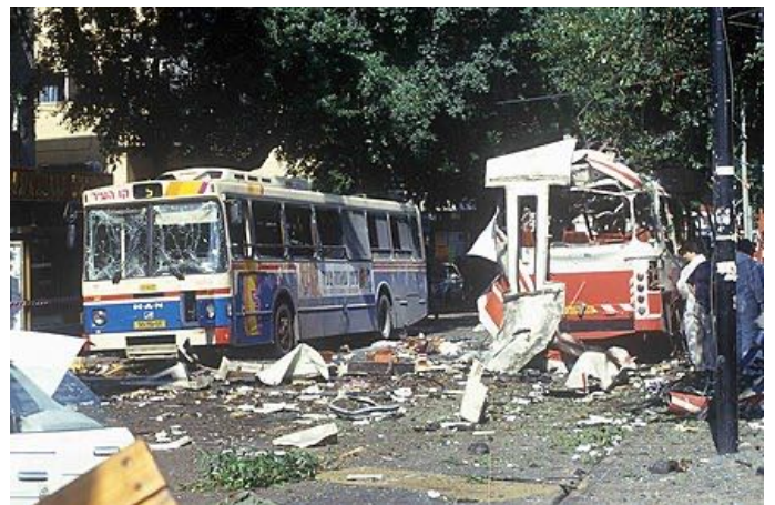
Effect of Hamas suicide bomb in Tel Aviv in 1994

Hamas has claimed responsibility for countless terrorist attacks and attempted attacks specifically targeting Jews, including suicide bombings (since 1993), firing rockets into population centres, the construction of “terror tunnels” for offensive use against Jewish civilians (including incursions for the purpose of kidnapping), incendiary balloons, stabbings, car rammings and more. The organisation is committed to the use of violence.