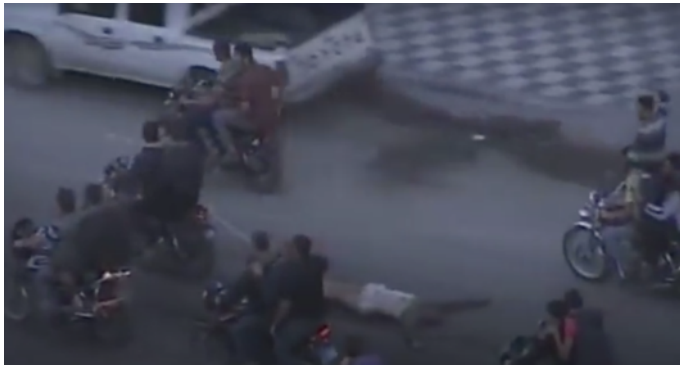
Hamas mob drags body by motorcycle through streets of Gaza

In 2006, the year after Israel withdrew its entire civilian and military presence from Gaza, Hamas won the legislative elections in the Gaza Strip. A year later, it reinforced its authority by coercively ousting its rival, Fatah, from the territory, including by murdering hundreds of Fatah members in what is known as the Battle of Gaza, described locally at the time as a “civil war”. Since then, Hamas has ruled the Gaza Strip as a dictatorship. The territory has been blockaded by Egypt and Israel — its two bordering nations — since Hamas forcibly took complete power in 2007.