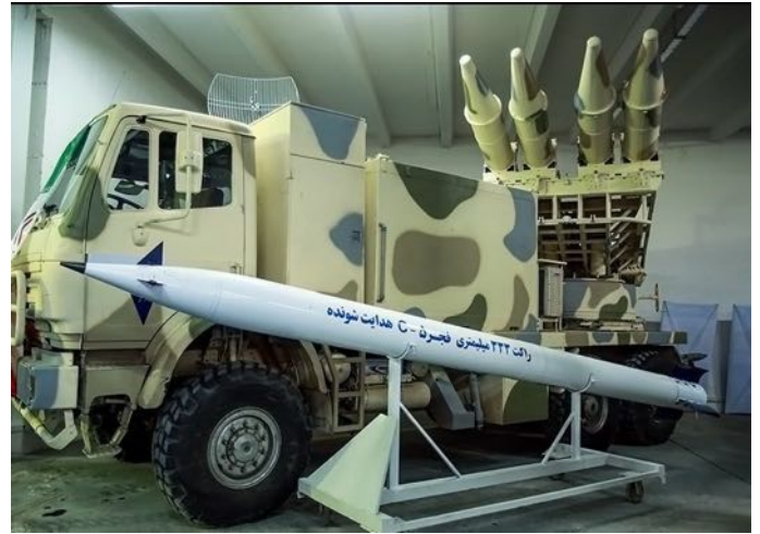
Hamas been firing Fajr-5 rockets since 2012

In addition to its terrorist activities emanating from both Gaza and the West Bank in the decades prior its complete takeover of Gaza, in the period since then it was engaged in full scale wars with Israel in 2008-9, 2012, 2014 and 2021, resulting in significant civilian and combatant casualties. Hamas is well known both for indiscriminately targeting Israeli civilian populations and also for deliberately doing so from within civilian populations in Gaza, both of which are war crimes.