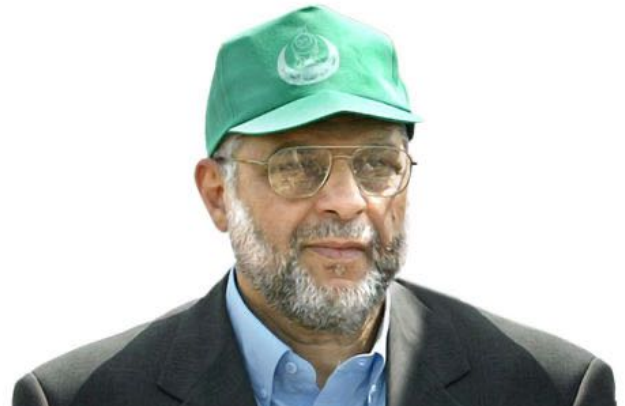
Abdel Aziz al-Rantisi

hand of the [Izz al-Din al-Qassam] brigades to do whatever they want against the brothers of monkey and pigs", referring to Jews.