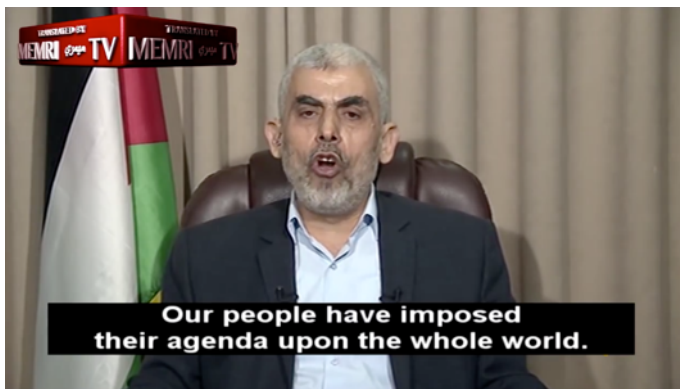
Yahya Ibrahim Hassan Sinwar

By way of more recent example, consider that, in March 2021, Yahya Ibrahim Hassan Sinwar, a former commander and founding member of Hamas' armed apparatus, was re-elected as the leader of Hamas in the Gaza Strip for a second four-year term, a role that oversees the group's political activities as well.