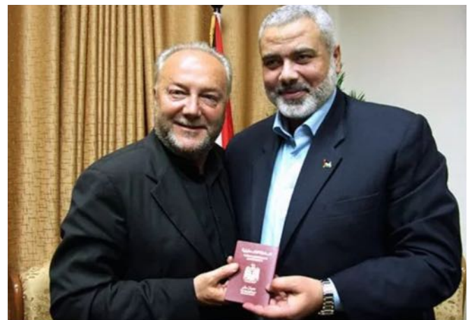
George Galloway receives a passport from Hamas Prime Minister Ismail Haniyeh

In 2009, Mr Galloway was reportedly described by one Hamas official as a "hero" and was awarded a passport by the Hamas Prime Minister, Ismail Haniyeh, in "deep appreciation" of his support.