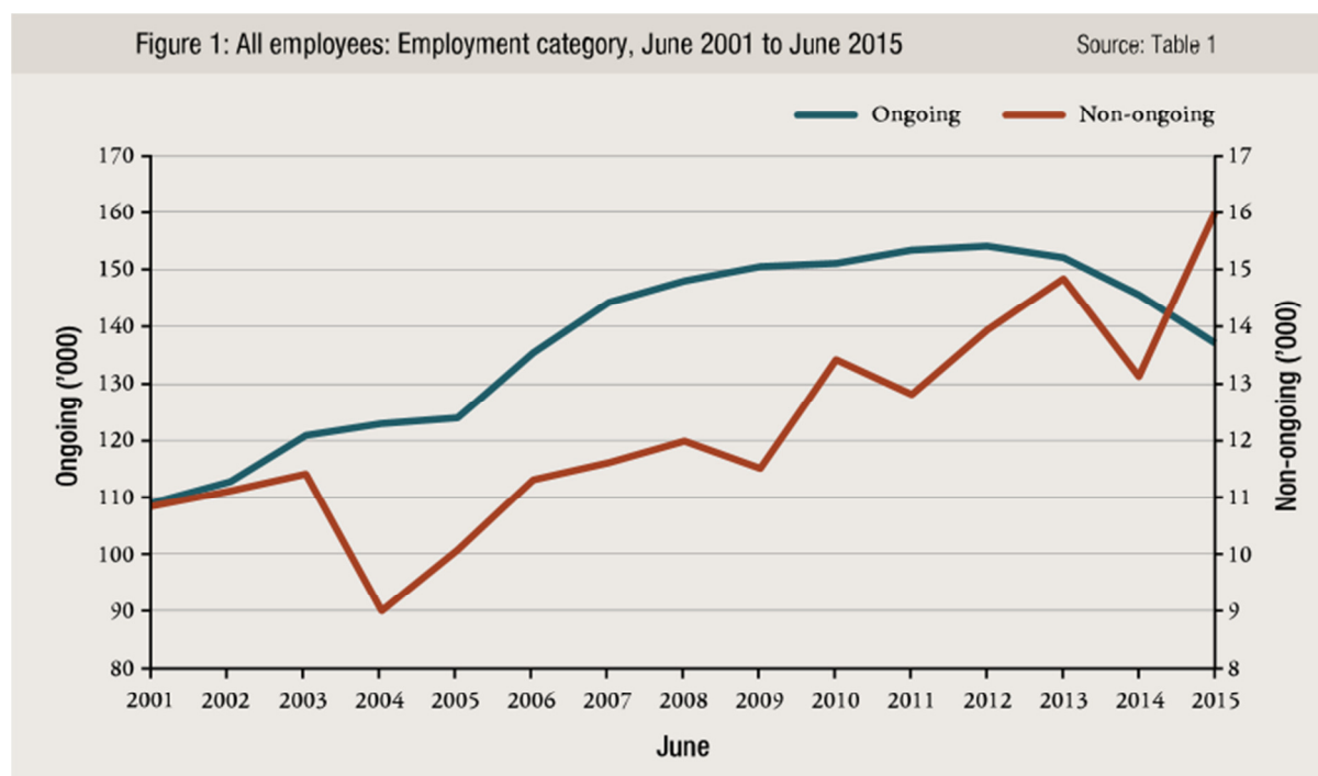
Table 1 outlines the staffing profile of non-ongoing employees by employment type and gender since June 2011. 5 The table shows that there has been an overall increase in the number of non-ongoing employees, with a high proportion being women.

According to the recent APS Statistical Bulletin 4 as of 30 June 2015, 15,932 employees were in non-ongoing employment with 5,463 of these classified as casual (intermittent and irregular).