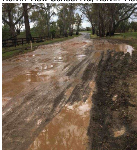
Mitchellstown Rd, Mitchellstown