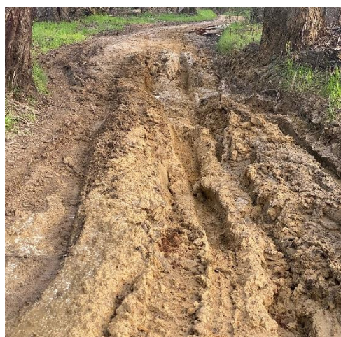
Chapmans Rd, Boho South