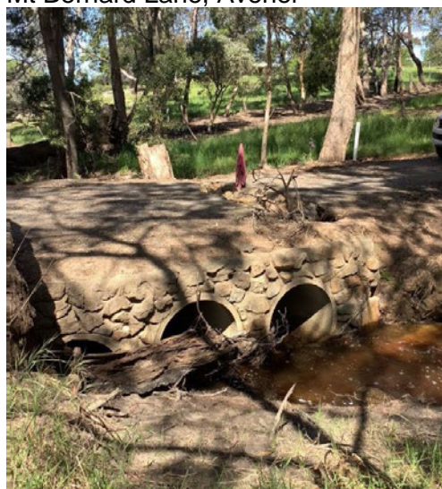
Kelvin View School Rd, Kelvin View