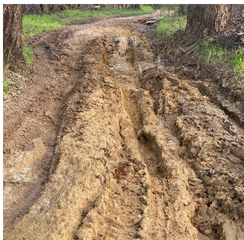
Chapmans Rd, Boho South