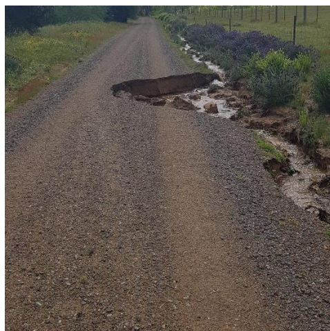
Mt Bernard Lane, Avenel