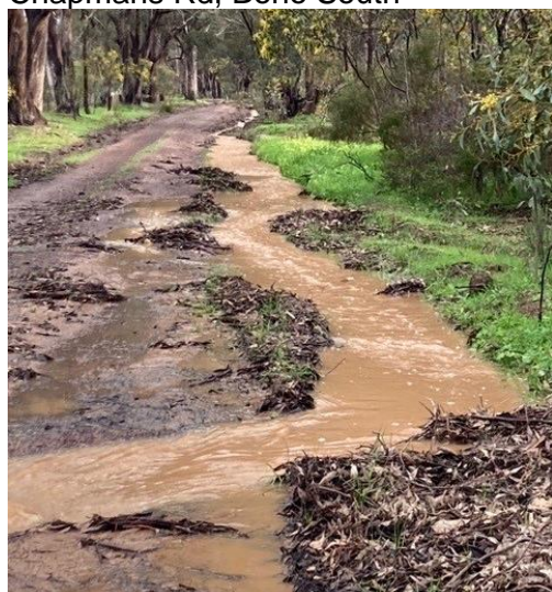
Pontings Lane, Bailleston