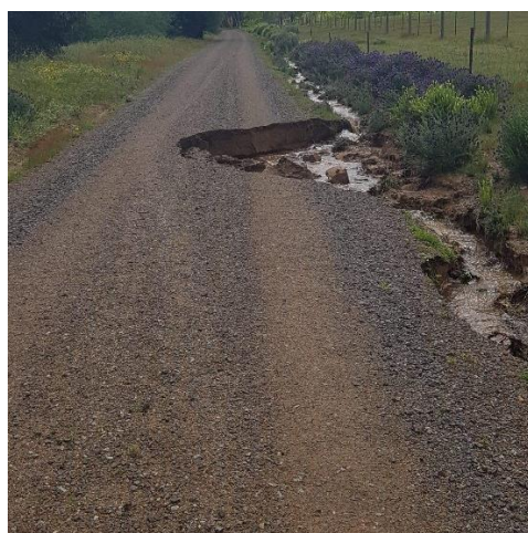
Mt Bernard Lane, Avenel