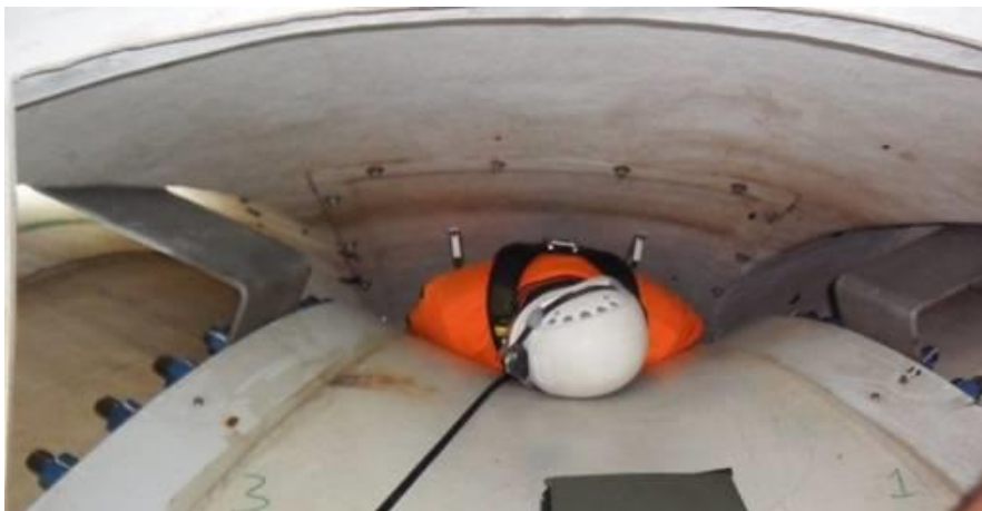
Figure 10- Maintenance worker crawling over the top of the Hub to access the inside of the Hub