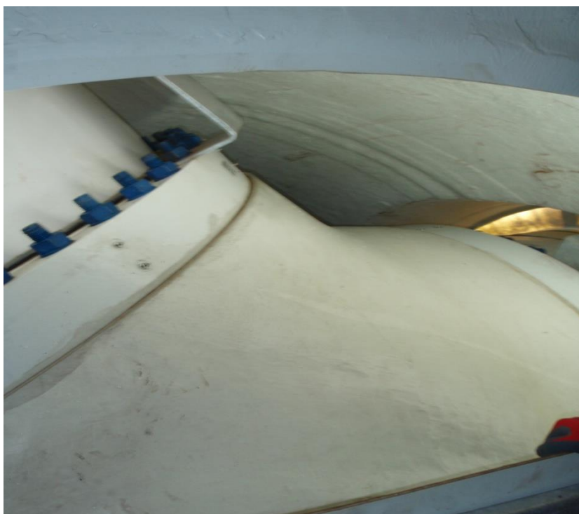
Figure 9- Depicts the Hub and blade connection. Cone over the outside.

Access to this area is required so maintenance can be performed on the inside of the Hub. There is hydraulics in the hub used to adjust the pitch of the blades to achieve maximum benefit from little wind. The worker accessing this area is required to crawl over the hub. See Figure 10