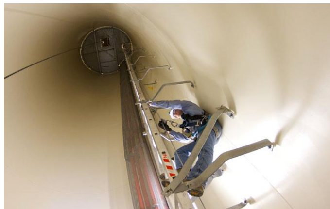
Figure 4- Ladder fixed to side of tower. Climbers back towards the side of tower