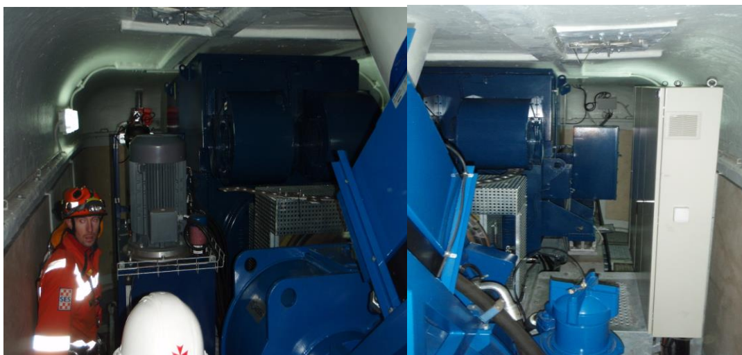
Figure 6 & 7- The inside of the Nacelle depicting the amount of space taken up by the gearbox and generator

The Nacelle is where all the work is done. The hub connects into the front of the Nacelle. The shaft that extends out of the hub runs into a gearbox. From the gearbox the next shaft connects to the generator. From the generator electricity is transferred to the cable system and down to the kiosk.