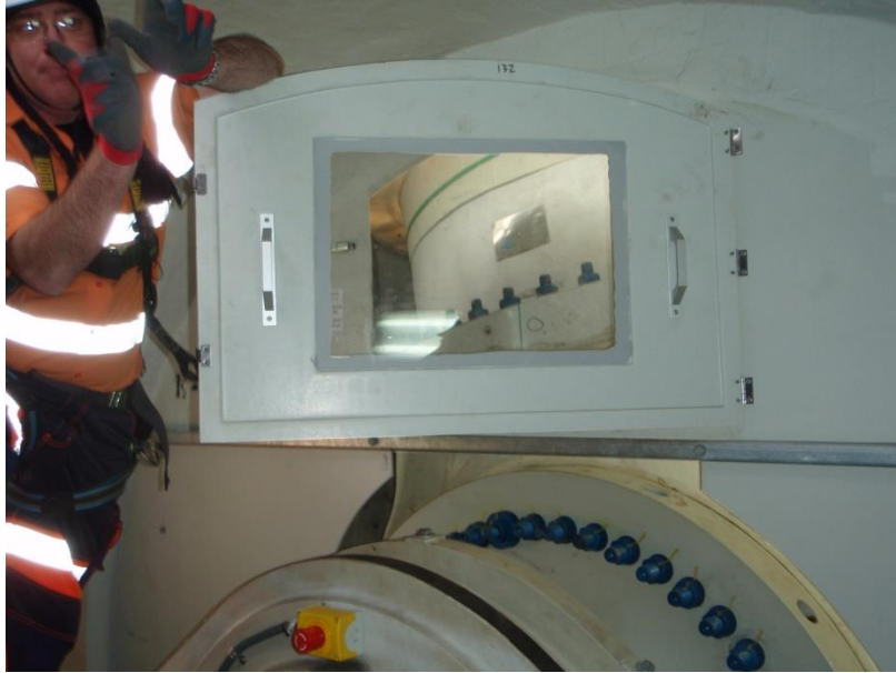
Figure 8- Access door from the Nacelle to the Hub. Note shaft connection underneath access door