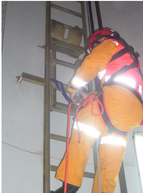
Figure 3- Ladder fixed to side of tower. Climbers back towards the inside of tower