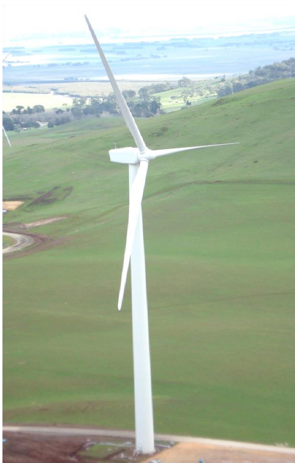
Figure 1-An 80 meter high wind turbine

To understand the associated dangers with wind turbines we need to look at and understand the components that go together to form a wind turbine.