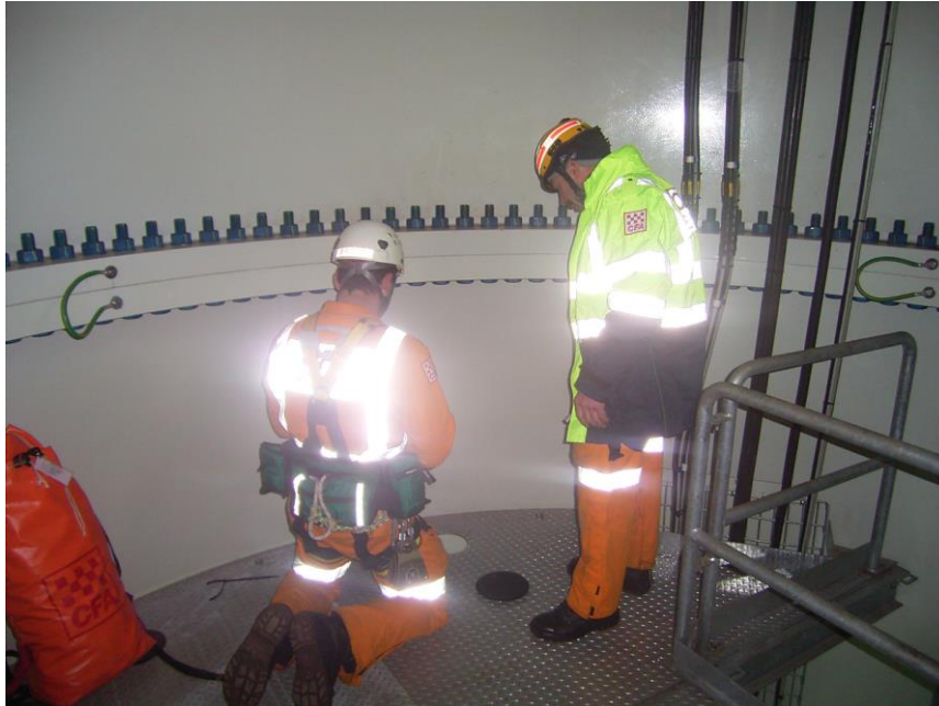
Figure 5- CFA Rescue staff working on a Gantry. Also note electrical cabling running down the side of the tower.