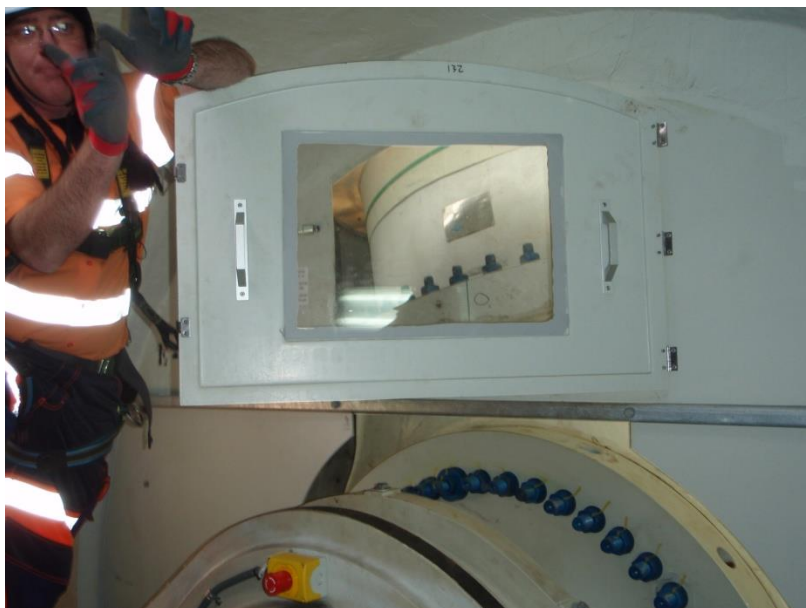
Figure 8- Access door from the Nacelle to the Hub. Note shaft connection underneath access door