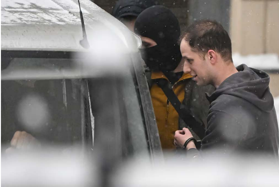
Detained U.S. journalist Evan Gershkovich, pictured in Moscow, Jan. 26, 2024

Worldwide, dozens of Australian, European, Japanese and American citizens have been arbitrarily detained in recent years, often for leverage. Scores still remain confined in heartrending conditions of humiliation, loneliness and uncertainty, all too often accompanied by human rights violations, including torture. We cannot let this stand.