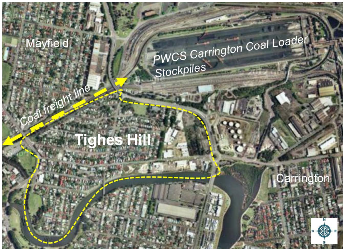
Figure 1: Location of Tighes Hill in relation to coal freight line and PWCS Carrington Coal Loader

with the increase of coal exports through the Port of Newcastle, to the extent that it is now back on top of the public policy agenda for Tighes Hill residents and other nearby coal-affected communities. I am currently an active member of the Tighes Hill Community Group (THCG), which has represented the interests of Tighes Hill residents since 2009. Concern about air quality was one of the motivations for forming THCG, and through THCG's organisational and community meetings and forums, strategic planning sessions, etc, Tighes Hill residents are once again regularly identifying local air quality as their no.1 concern. An Air Quality Working Group was one of the first sub-groups established by THCG, and this group remains active, regularly participating in structured discussions organised by the community, government agencies or local industries on air quality issues.