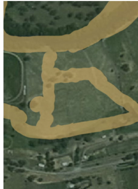
LES RIDD 'GLEN DOONE' FLOOD FOOT PRINT 12000ML