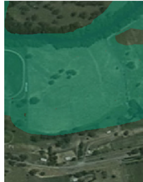
LES RIDD 'GLEN DOONE' FLOOD FOOT PRINT 15000ML