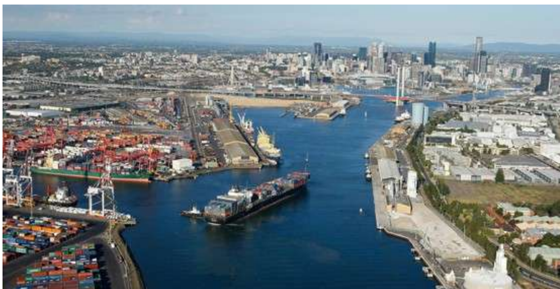
Port of Melbourne

The opportunity cost of allowing foreign vessels to compete in the Tasmanian marketplace should be carefully considered beyond the immediate price benefit and towards the longer term service provision outcomes and obligations to Tasmanian businesses and communities.