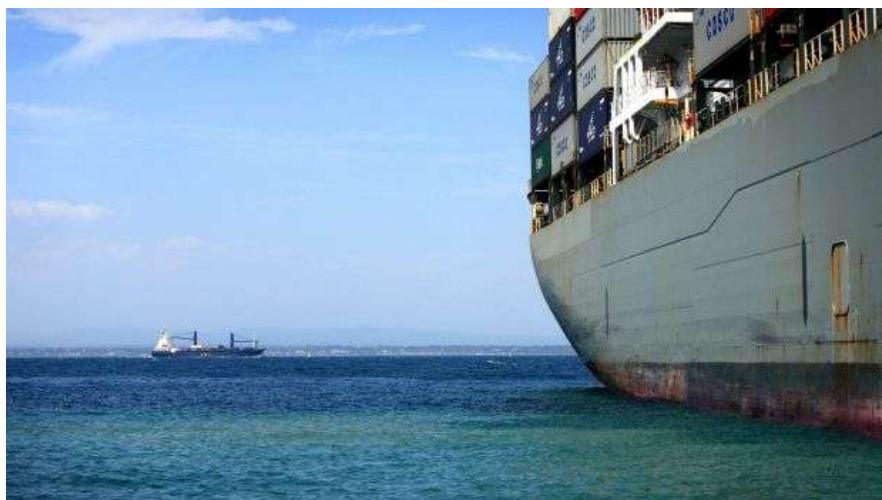
Opponents to the shipping industry changes say they will cost jobs.

Less than 100 seafarers would remain in employment out of a current workforce of 1177, according to a report written by the Australia Institute, based on government documents supporting its Shipping Legislation Amendment Bill.