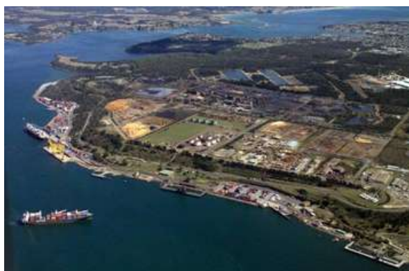
Bell Bay Port Tasmania

The adage of price versus service shapes this argument with both considerations forming significant ongoing debate and opinion. Qualified independent research may be required to substantiate the claims made, along with further consultation with all major stakeholders to ensure the needs of Tasmania are considered and protected accordingly.