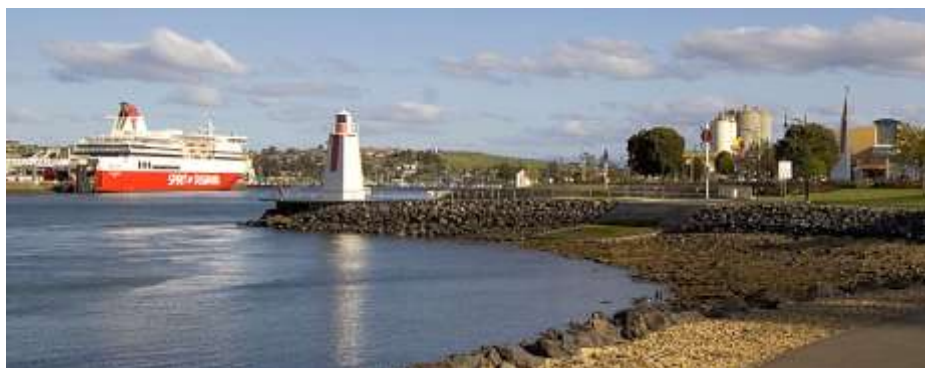
Devonport Port Tasmania

What will the impact be if local shippers remove themselves from the market – ie: employment, impacts on communities and coastal port towns?