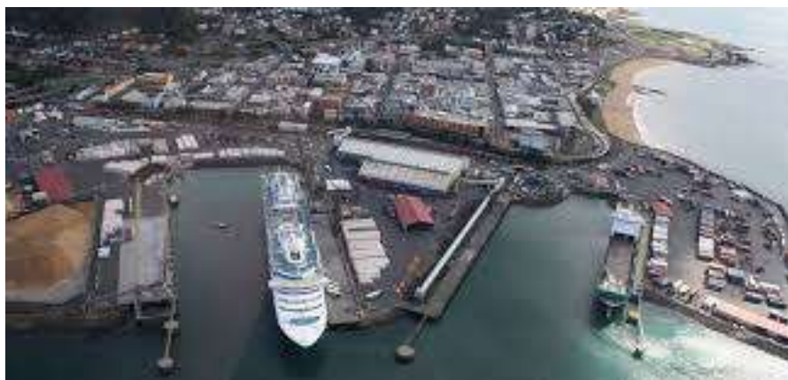
Hobart Port - Tasmania

Additionally, the lack of relief for bulk commodity shipments could potentially threaten the ongoing long term viability of Tasmanian based industry where no low cost alternate shipping options can be sourced.