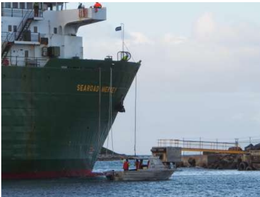
King Island Port - Tasmania

In times where one shipper is forced from service (in the case of Spirit of Tasmania suffering damage in a freak wind event in port in Melbourne in 2016), can the current shippers collaborate and maintain the freight service requirement – can foreign vessels provide an alternate option?