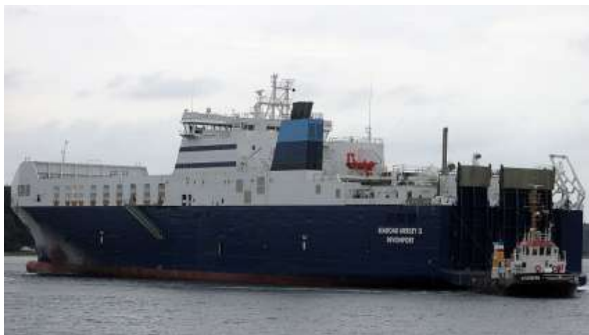
SeaRoad Mersey 2

A well publicised campaign against these changes has been orchestrated to provide the public with an understanding as to why the Act needs to remain for Australia. Specifically, the need to protect jobs and to maintain the security and integrity of Australia’s maritime shipping industry.