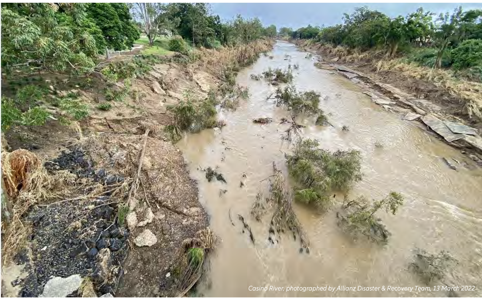
Casino River, 13 March 2022