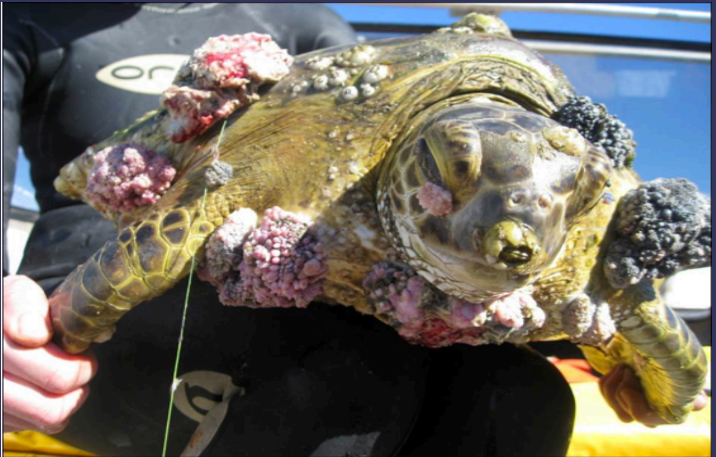
Cover photo - Diseased Green Sea Turtle from Edgcumbe Bay near Bowen

Written by Jonathan Meddings BMedLabSc(Hons)