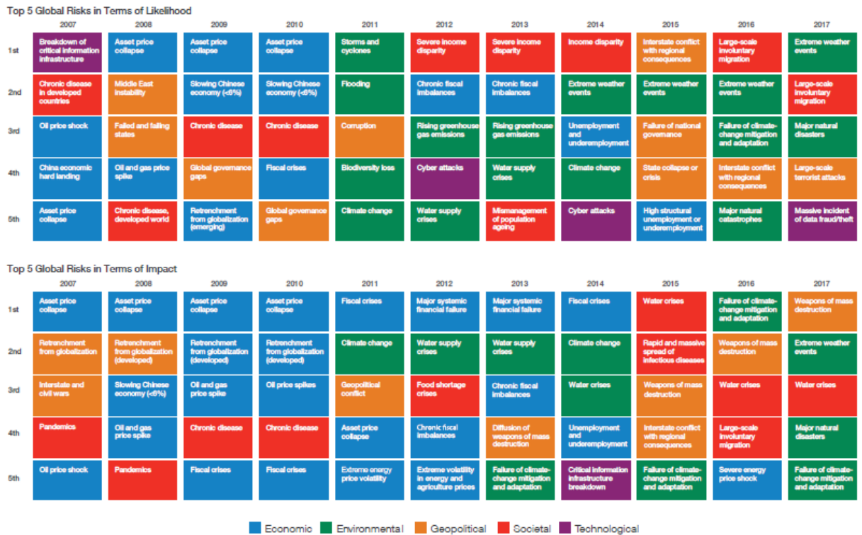
Figure 2: The Evolving Risks Landscape, 2007-2017

Page 73 (of 76) of the World Economic Forum Report 2017 sets out the ‘ Top 5 Global Risks ’ – termed ‘ Evolving risks ’. Note the ‘Top 5’ now strongly features ‘ Environmental risks ’ that are linked directly or indirectly to ‘ Climate Change ’. Note the increase in ‘ Environmental risks ’ since 2011. Also note that ‘ Water Crisis ’ has been re-classified as <societal> although many of the associated water issues are also climate-related.