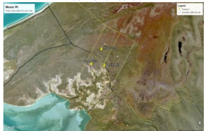
Many people believe that these 313.3 ha next to the Puthoo fens should be incorporated into the National Park.