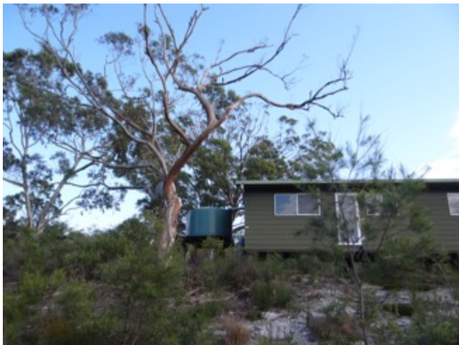
The 2013-14 drought took a heavy toll on Scribbly Gums growing on the Lake Coomboo lunette. The 2016-17 drought has added to this death by drought.

Around Lake McKenzie’s (Boorangoora’s) lunette large Scribbly gums were observed dead or dying from the heat and drought. Monotoccas, Phebaliums, and Blueberry Ash were affected. The death of so many vines surrounding the Lake McKenzie (Boorangoora) picnic area looked as if there had been an attack of Agent Orange. This isn’t the first time that FIDO has noted Scribbly Gums dying. A similar and only slightly less severe drought in 2013-14 saw many of the same species die (See MOONBI 130).