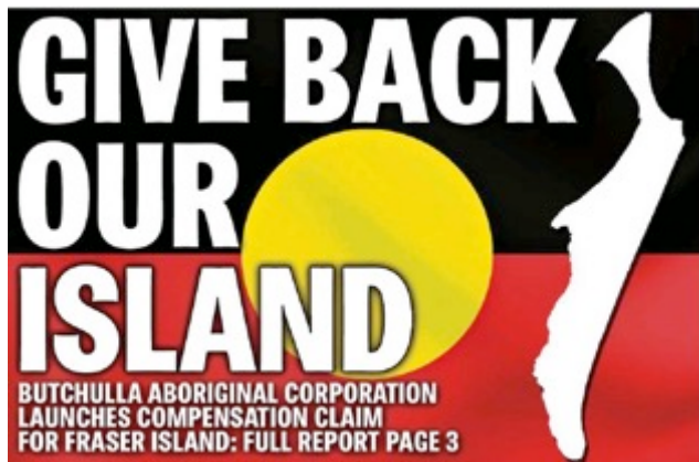
From front page Fraser Coast Chronicle

Any money gained would be injected into preserving the Butchulla culture and improving Fraser Island. She said that they would use the compensation to start their own barge service. They want more from this Australian tourism hotspot that draws hundreds of thousands of people every year.