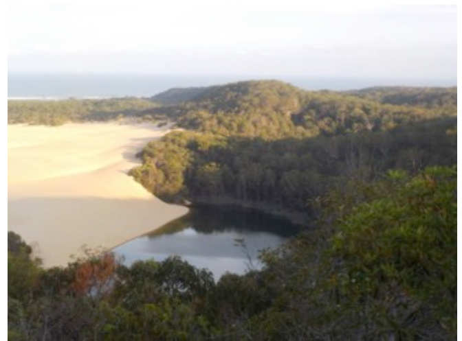
Wabby Lake from the Lookout

Compare entry fees for world class cultural events — the theatre, opera, exhibitions, or even a pop concerts by a visiting entertainer and it is clear that the visitor fees for the Fraser Island (K’Gari) are significantly underpriced. People have less respect for anything that they consider “cheap”.