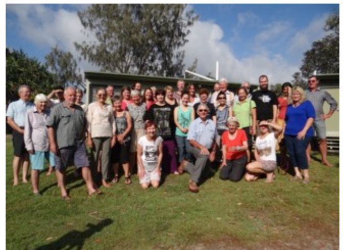
Participants in the 2016 Fraser Island (K’Gari) BioBlitz came from as far as Darwin to Ballarat to help identify as much as possible of K’Gari’s biota. This is the group on the last day of this event.

http://www.abc.net.au/news/2016-12-05/fraser-island-bio-blitz/8092310