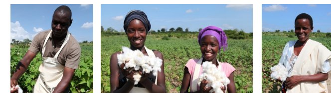
The BPP promotes stability, economic growth and poverty reduction in Kwale.