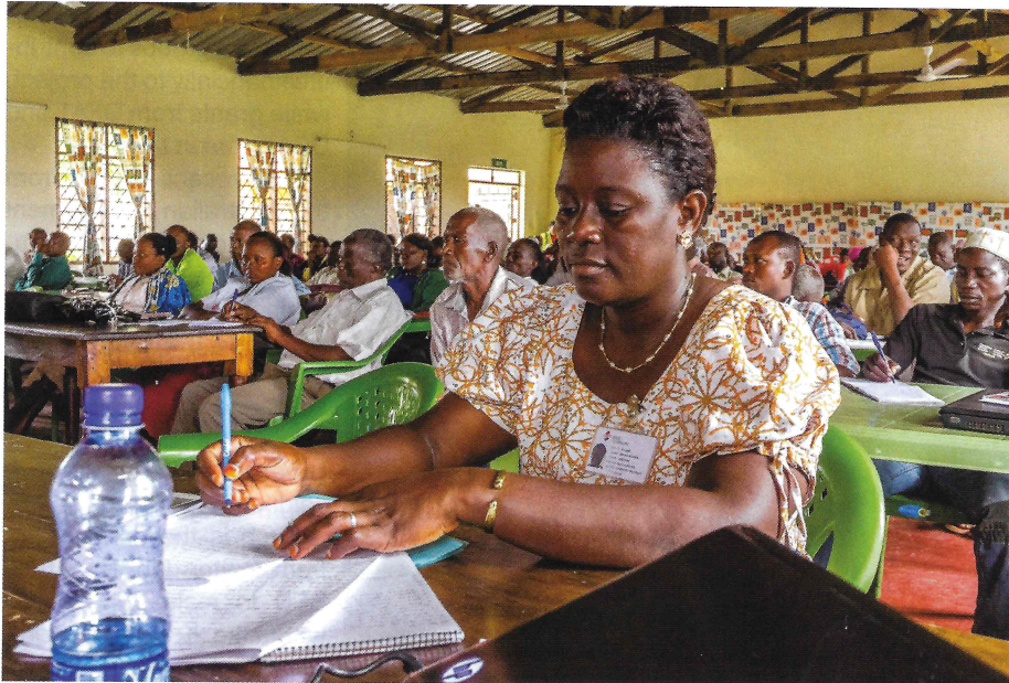
Providing opportunities for everyone in a community, particularly women, is critically important