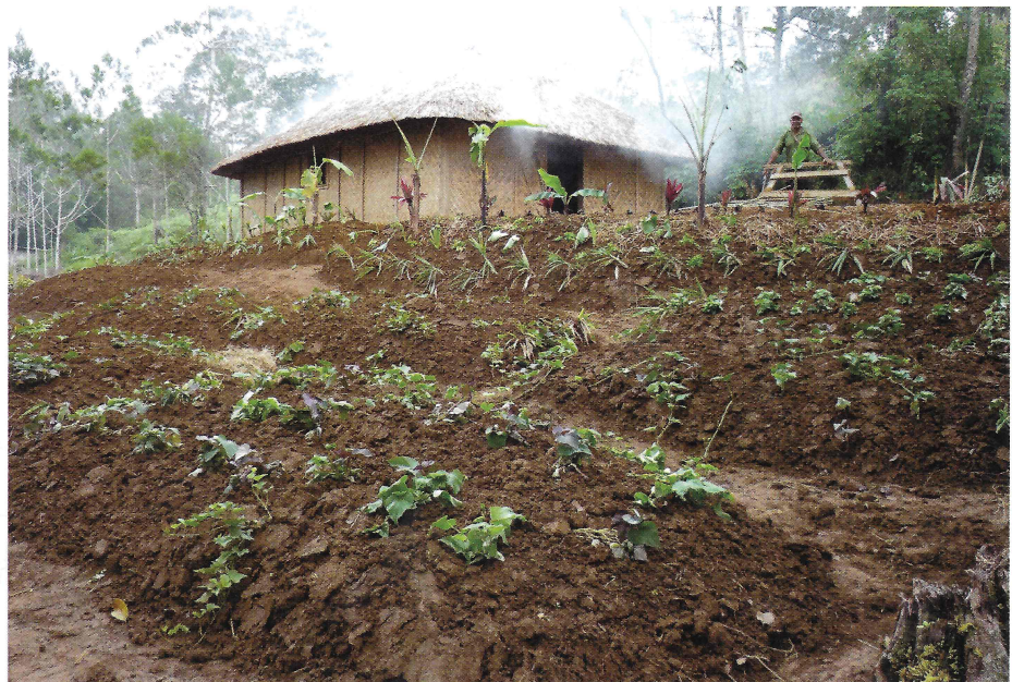
Drought is an issue worldwide and instilling confidence in farmers that a profitable crop can be harvested at season's end is a challenge

In some respects, Cotton On has had to be held back from expanding its Kenyan programme too quickly, despite increasing interest and overwhelming support from outsiders.