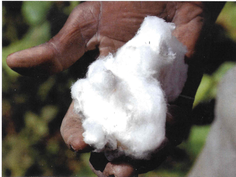
Cotton farming is not the most environmentally-friendly practice and harvesting crops is monitored closely

"That's where the beauty of this is, we have visibility and the direct impact with the farmer to send it down the supply chain."