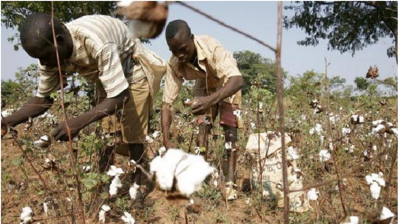
Cotton On will source cotton directly from Kenyan farmers.

The billion-dollar Cotton On retail group is poised to sell fashion products made from cotton grown by farmers in Kenya in its Australian stores as a significant step towards sourcing all its cotton from ethically produced sustainable sources across the globe.