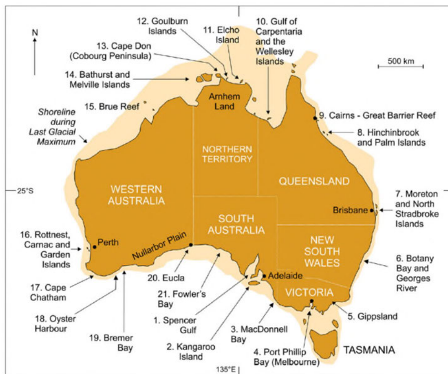
Figure 1: Map of Australia showing 21 coastal locations with surviving Aboriginal stories about coastal inundation 7000 years ago. The light orange area shows the extent of exposed continental shelf at the height of the last glacial maximum (~20,000 years ago). [3]

In collaboration with Traditional Owners, AIMS is currently taking steps to consider the existence of Indigenous underwater heritage and the potential impacts of AIMS' research operations on that heritage. We are developing institutional policy, procedure and training to improve the ability of AIMS researchers to identify and document submerged heritage sites that they may encounter; and better risk-manage the possibility that AIMS operations might disturb cultural heritage sites, particularly research activities that significantly disturb the seabed.