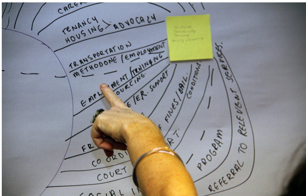
Photograph: Excerpt of service mapping exercise

Participants drew lines to represent relationships between the family and agencies: if a government funder had no direct relationship with the family, the line would be to another service provider or agency rather than directly to the family; the service provided was written along the line; broken and un-broken lines were used to depict the strength of relationships.