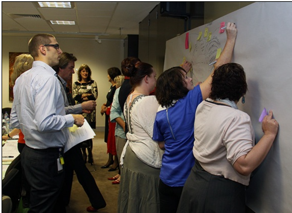
Photograph: Participants during service mapping exercise

The service mapping was a great way of getting everyone involved and making them see how the service sector is not that co-coordinated.