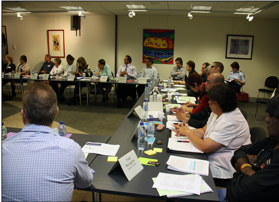
Photograph: Workshop participants