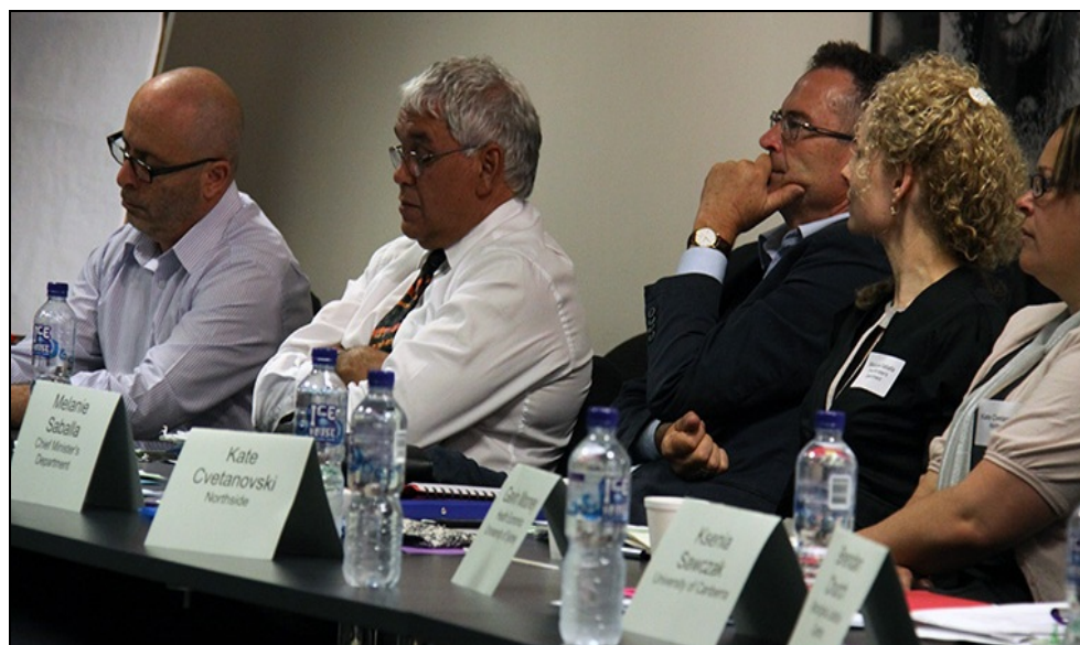
Photograph: Workshop participants