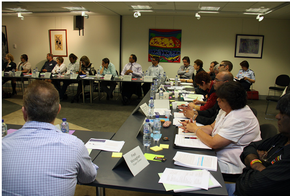
Photograph: Workshop participants