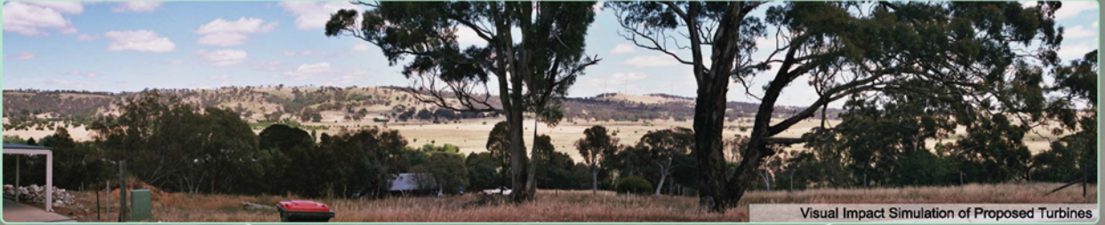
Visual Impact Simulation of Proposed Turbines

Proposed view prepared by certified survey accurate process