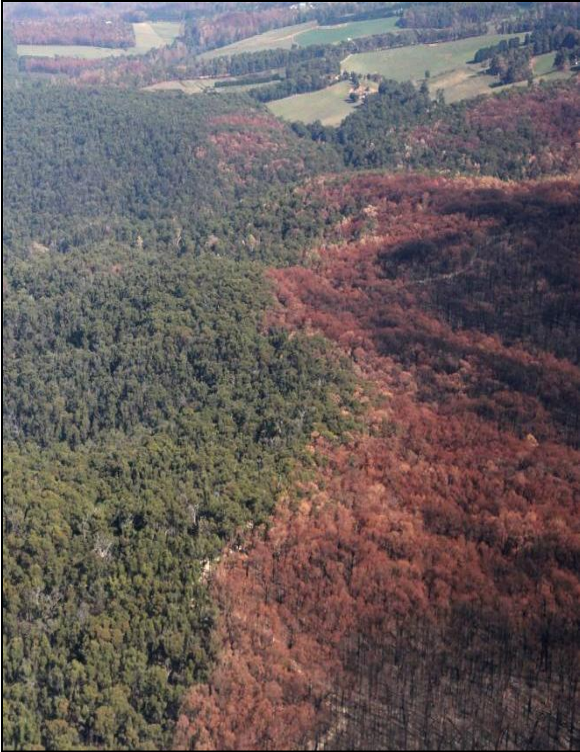
Figure 4: Demonstrated impact of extensive low fuel loads on wildfire control. Forest at North Kinglake burnt on February 7 th 2009 (on the right of the photo). Green forest canopy (on the left) is area that was burnt in the 2006 Kinglake fire which provided an extensive barrier to the spread of the 2009 fire.