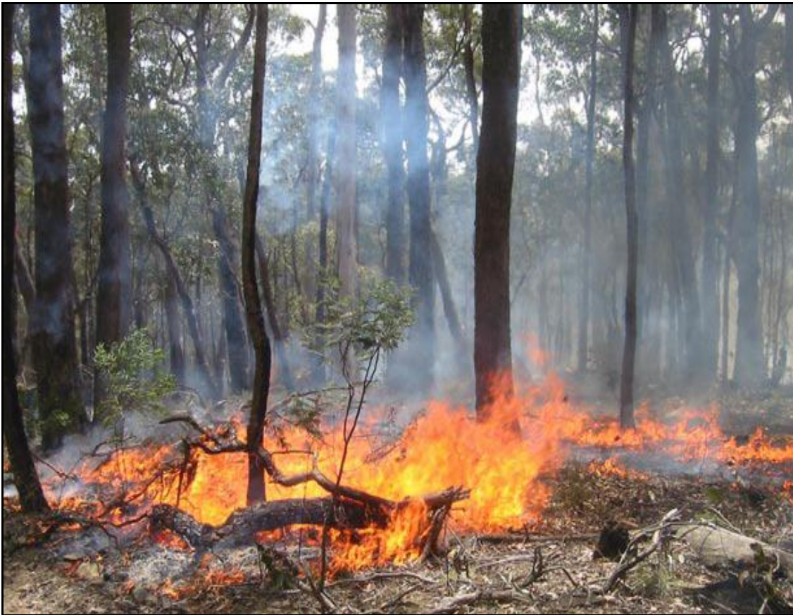
Figure 2: Low intensity prescribed burn in the Wombat State Forest

Their principal finding was that the area treated annually by prescribed fire had had a significant effect on the annual number and extent of unplanned bushfires over a 52-year period. During this period, an average of more than 80% of the annual burnt area was attributable to prescribed fire. They also concluded that a six-year cycle of prescribed burning significantly reduced bushfire hazard.