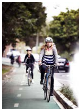
Today's bicyclists are everyday people in everyday clothes making everyday trips

This worldwide trend has little to do with spandex-clad bodies engaging in sports cycling and more to do with ordinary people just getting from A to B. Governments are looking to mainstream cycling and are using imagery that is very different to the hardened, helmeted, sweaty bodies of past cycling promotion efforts. Today's bicyclists are everyday people in everyday clothes making everyday trips.