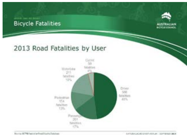
Figure 2. Road fatalities by user