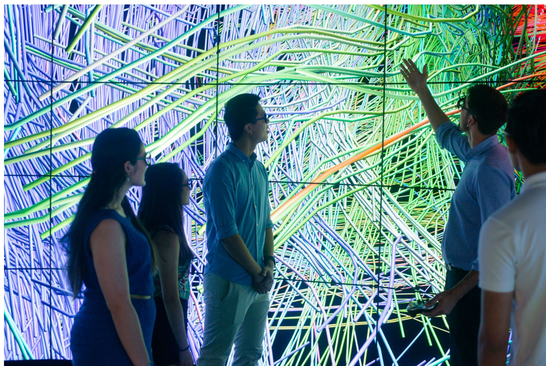
Monash Immersive Visualisation Platform (CAVE) – Monash University, Clayton campus

Both the HEEF and the EIF offered universities, via annual competitive rounds, the opportunity to compete for funds for priority infrastructure projects. Taken together, the HEEF and EIF funds have supplemented individual university contributions to develop world class research facilities infrastructure that supports Australian industry.