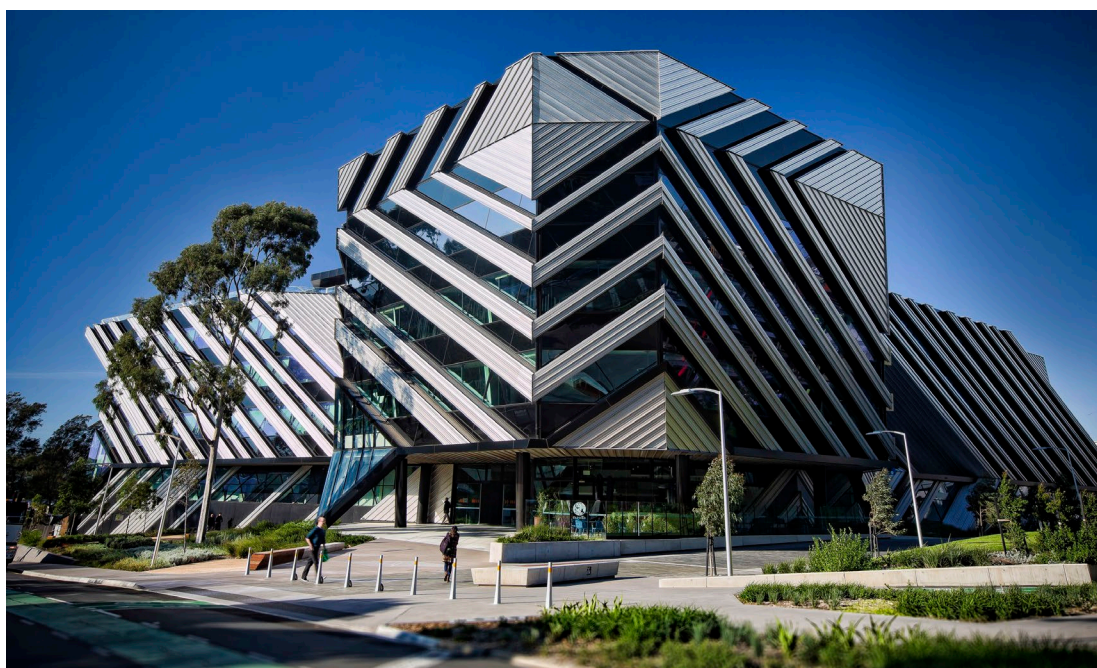
New Horizons building, Monash University, Clayton campus

The New Horizons building is a collaborative research environment that creates new multi-disciplinary research opportunities for industry, engineers, scientists, researchers and government in the fields of future manufacturing, modelling and simulation, biological engineering and renewable energy. Over 400 CSIRO and Monash researchers are working with visionary industries and Australian manufacturers in areas such as advanced manufacturing, medtech, metal processing, aerospace and fibre industries.