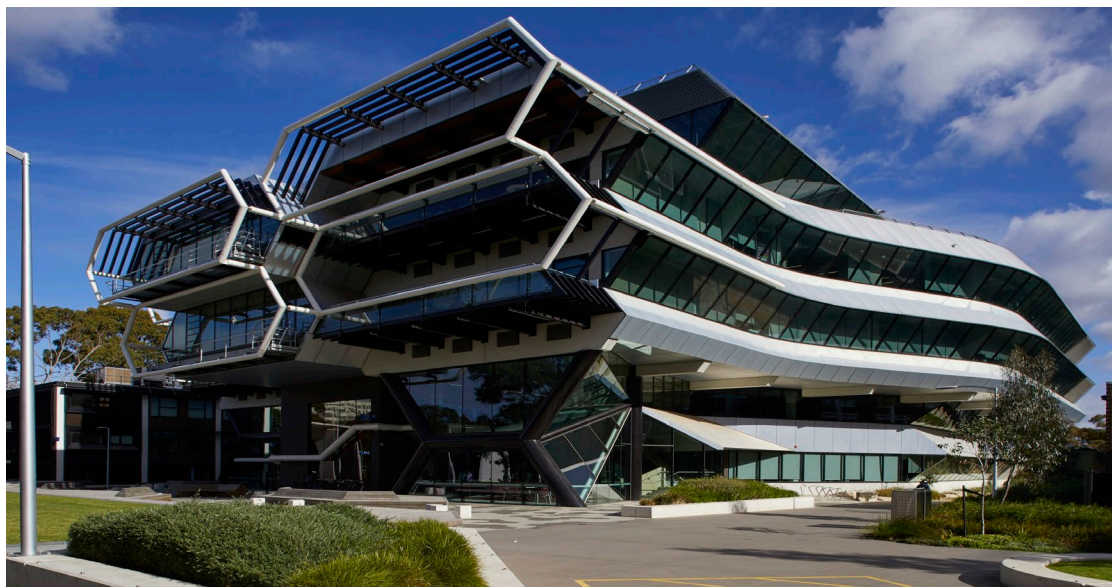
Green Chemical Futures building, Monash University Clayton campus

of various related industry, research and student teams, provides opportunities for collaboration and innovation that would not occur otherwise.