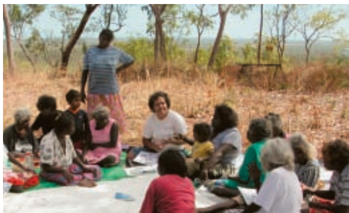
▲ Darwin Community Legal Service Indigenous Aged/Disability Advocates delivering advocacy skills workshop at Wadeye in the NT.

The community-focused cooperative and consultative framework of CLC service delivery is particularly suited to effective work with ATSI communities. CLCs listen to their communities, employ Indigenous workers, learn from the Indigenous peoples' experiences and resource their solutions. Where CLCs identify gaps in service they use their local knowledge and experience to leverage extra resources.