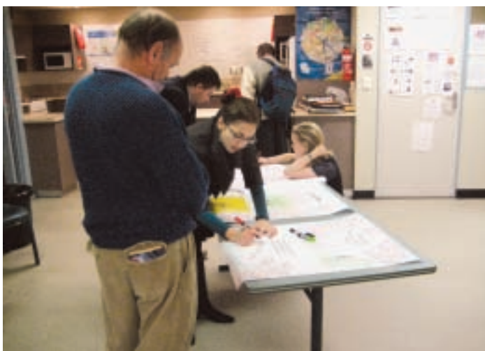
▲ Getting the views of homeless people. The NSW Homeless Persons Legal Service was one of many CLCs that made a submission to the Australian Government's Green Paper on Homelessness earlier in 2008. The HPLS held a number of meetings with people experiencing homelessness to get their views on what the government should do to address the problem.