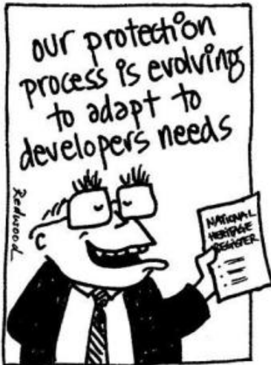
Little has changed since Howard era country.

Of the 1790 species listed as threatened under the EPBC Act, only 666 have a recovery plan. The percent is similar under the Victorian government's FFG Act. Of those awaiting a Recovery Plan, many are critically endangered. This is an appalling situation, made even more appalling by the plans to weaken the EPBC Act.