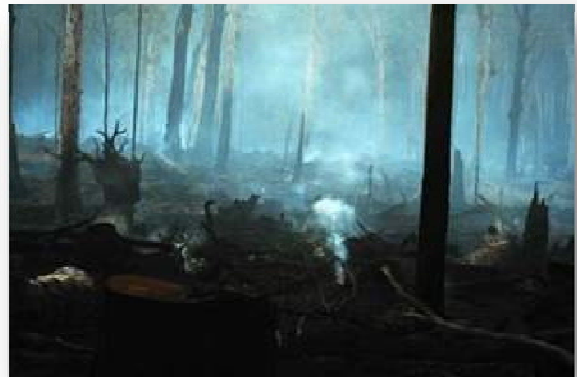
Figure 4. The adjoining old growth forest at Brown Mountain which was clearfelled and burnt - also supported threatened wildlife such as Powerful Owls and Potoroos

Large areas of Brown Mountain's old growth forest stands had been previously clearfelled and converted to tree crops, under the 1997 East Gippsland RFA. No federal intervention was deemed necessary as the states were trusted to protect vulnerable and valuable public lands, National Estate and endangered wildlife. Despite never honouring obligations under the RFA for reporting or reviews, despite these serious examples of neglect being detailed and sent to the federal env minister/s, the state government has persisted with the onslaught against our rare and threatened species, against laws and signed agreements.