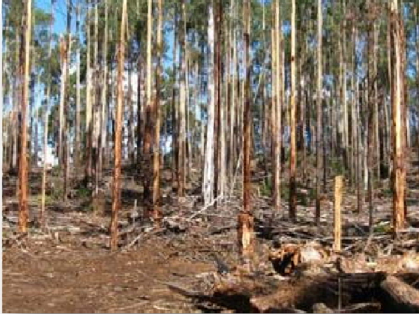
Figure 3. Diverse old growth forests supporting threatened species are clearfelled and converted to industrial woodchip crops through intensive management under the RFAs.

The EPBC Act hands all responsibility for forests to the states if they have RFAs in place. These forested areas that are demanded by the logging industry, of course, are the most valuable, rich, high yielding, and biologically intact. They grow on the most fertile sites with high rainfall and good growing potential. The logging agencies' agenda, supported financially and politically by state governments, is to clearfell and convert valuable