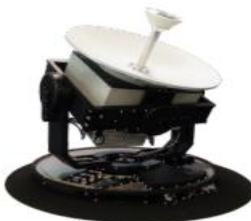
Figure 1. CHORUS terminal rendition

Shoal is applying company-developed digital engineering methods and tools to help guide and expedite the CHORUS development effort. By developing and maintaining a 'digital twin' of the system being designed, optimisation and design trade studies can occur concurrently with research activities, whilst maintaining a 'single source of truth' accessible to all stakeholders and an audit trail of decision points and rationale.