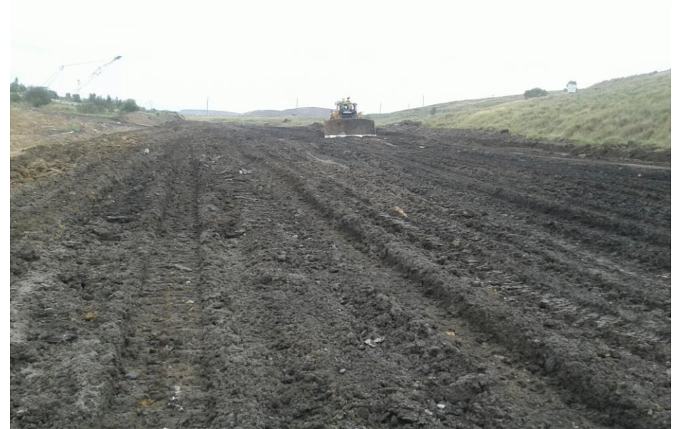
Monday, 5 March 2018, the first day of Malabar's rehabilitation works at the Drayton Mine.

To that end, we have had preliminary conversations with the local community about different ways the land could be used.