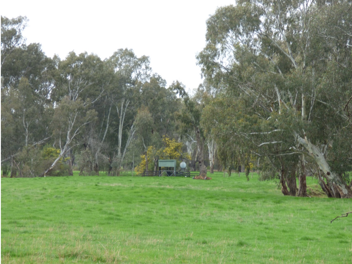
Yea River property, as shown above, when not flooded

Unless ALL landowners consent to negotiate easements it will be impossible to progress the Constraints Strategy, as the Commonwealth Government have stated that “easements will not be forcibly acquired”.