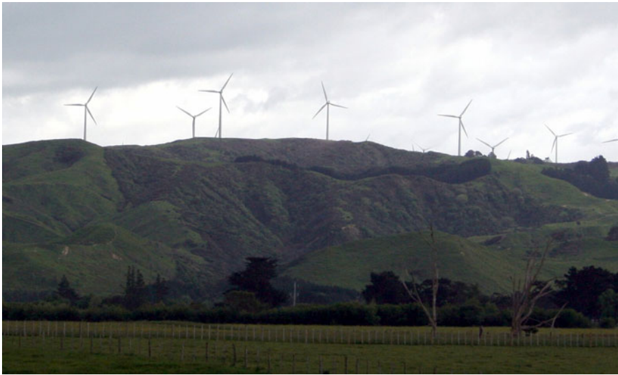
Fig. 1 Visual impact of the Palmerston North wind farm on the scenic vista, taken by the author while on holidays in Aotearoa, New Zealand; December 2008

development, which aligned to the UK position (Hindmarsh and Matthews 2008). The minister subsequently proposed a National Code on Windfarms to actively involve local communities in project implementation (Australian Government 2006). Supported by local government, the renewable and wind energy industries, planners and community interests, a federal government-led roundtable began to develop national guidelines. State governments, however, did not participate in rejecting a participatory national code as posing too much red tape for development. State governments also claimed existing public engagement was sufficient. But in following the limited public involvement mode that claim was contradicted by the rise of intense and consistent local contestation, with the new social movement of landscape guardian groups in the vanguard. By 2007, for every second wind farm proposal, a landscape guardian group had emerged to contest it (with 42 wind farms constructed by 2007; Hindmarsh and Matthews 2008: 218). In late November 2007, a looming federal election stalled the roundtable's deliberations.