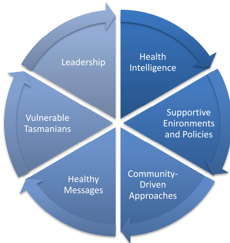
Figure 3. Fair and Healthy Tasmania – Recommended Model for Health and Wellbeing 16

In line with these findings, the review also recommended a model for supporting Tasmanians to be healthy, well and in control of what matters to them (See Figure 3). The recommended model identifies six streams of activity. Combined these activities would form A Fair and Healthy Tasmania Model of Health and Wellbeing (see Figure 4.) Collaborative partnerships that support the development of healthier communities are at the heart of much of this work.