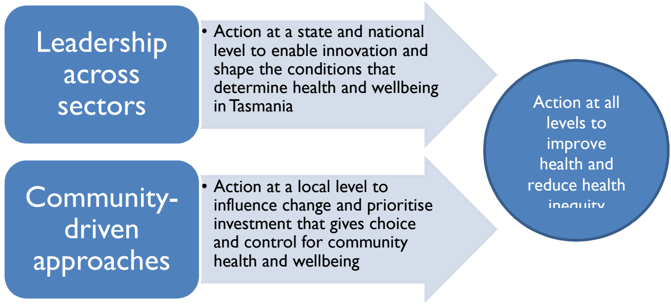
Figure 2. Recommendations of the Fair and Healthy Tasmania Strategic Review 15

In line with these findings, the review also recommended a model for supporting Tasmanians to be healthy, well and in control of what matters to them (See Figure 3). The recommended model identifies six streams of activity. Combined these activities would form A Fair and Healthy Tasmania Model of Health and Wellbeing (see Figure 4.) Collaborative partnerships that support the development of healthier communities are at the heart of much of this work.