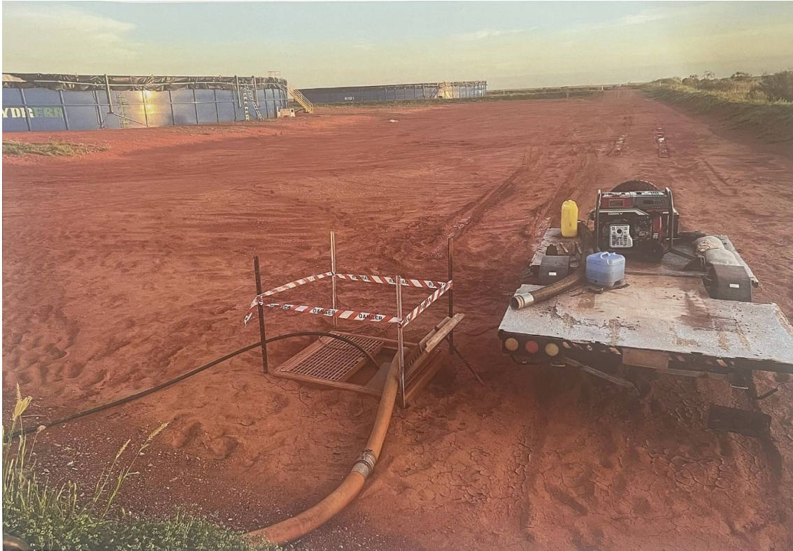
These are the uncovered waste tanks at the Hydrea Water Treatment Plant near Tennant Creek Town, notice the sump has been under water from recent rain.