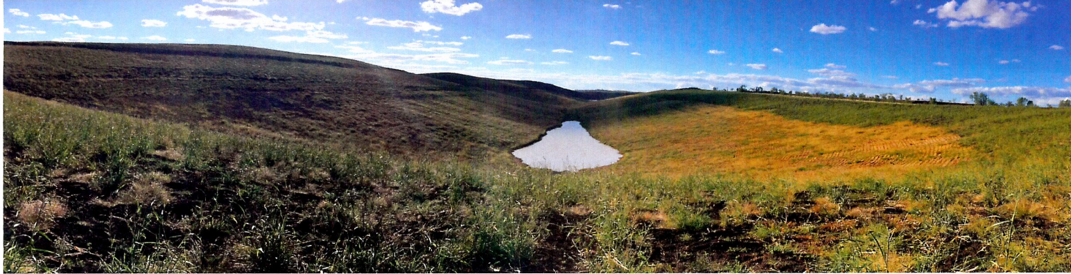
Newlands mine is successfully rehabilitating open cut voids (above and middle) and has established a Bowen Basin coal mining first for certification of rehabilitated overburden (below).