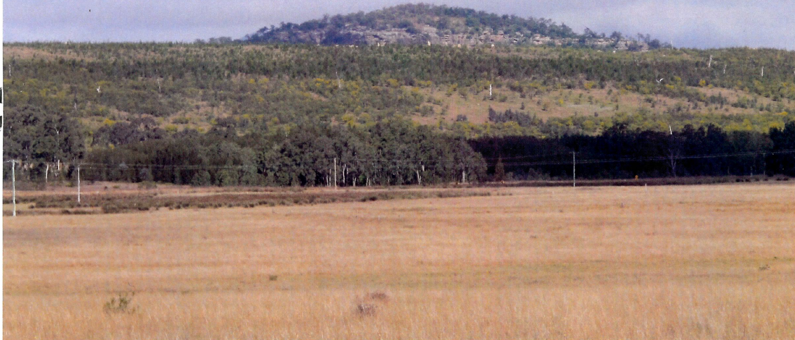
Mangoola's natural landform rehabilitation (above and below) is considered an industry benchmark in the NSW Upper Hunter.