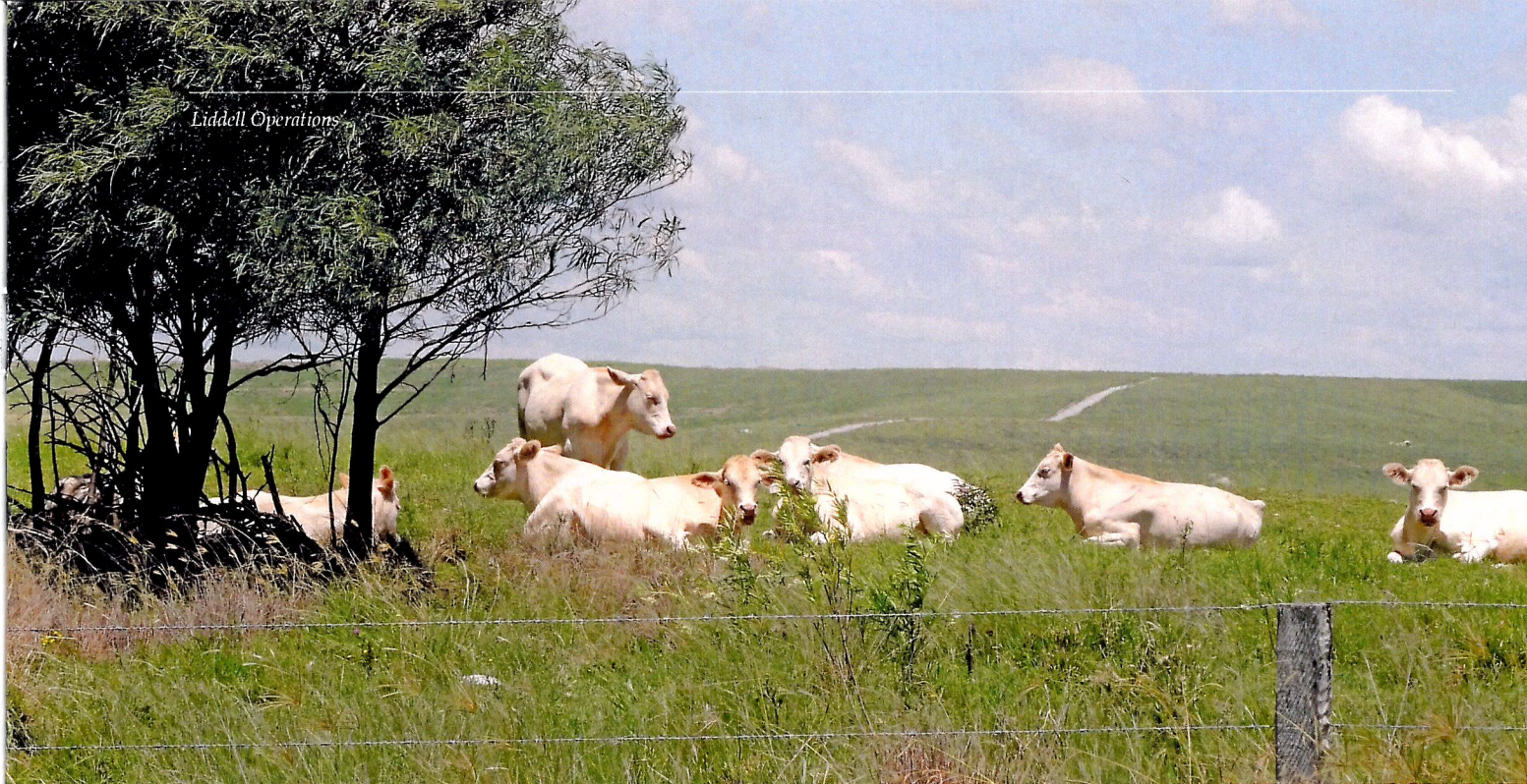
Cattle grazing on rehabilitated pasture at Liddell open cut mine (above) with more mined land returned to pasture (below).