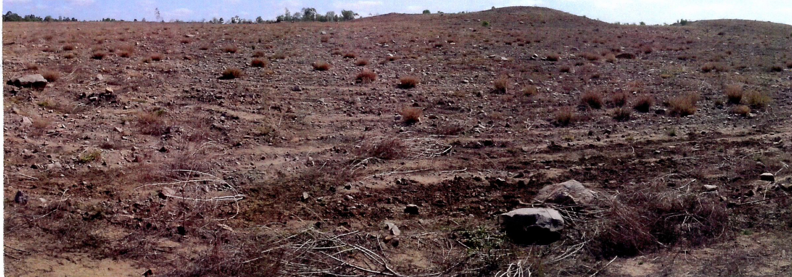
Above, an Oaky Creek mine void after shaping and seeding in December 2015 and, below, with dense vegetation in April 2017.