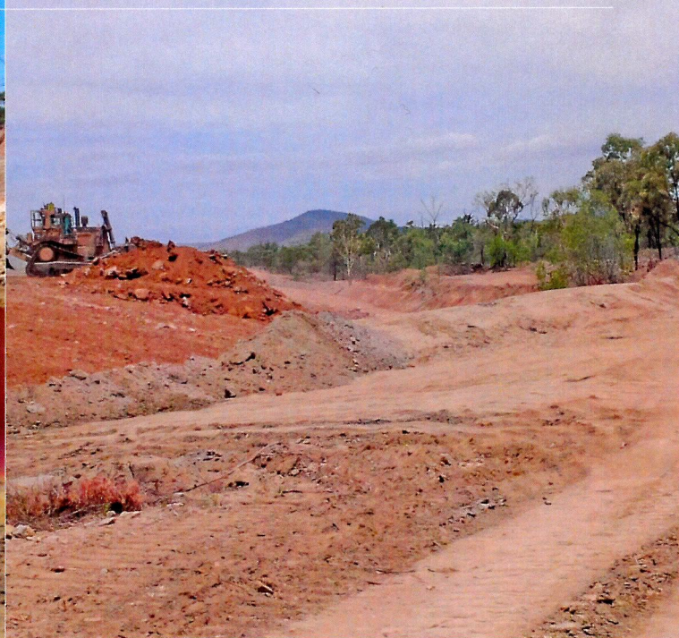
(Clockwise from top left). The transformation of Collinsville's Garrick East open cut void from 2015 to today.