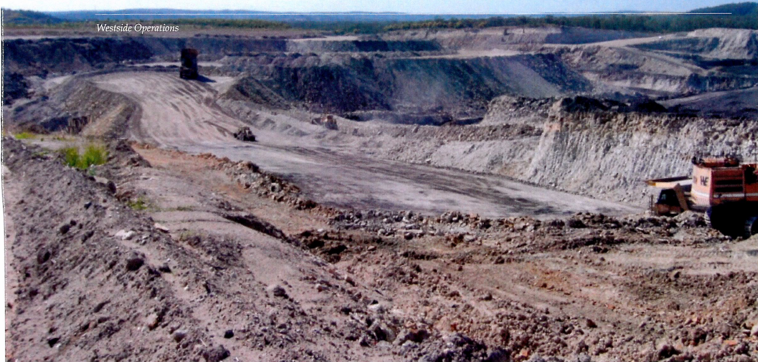
Westside mine during operations (above) and what visitors see from the same spot today (below).