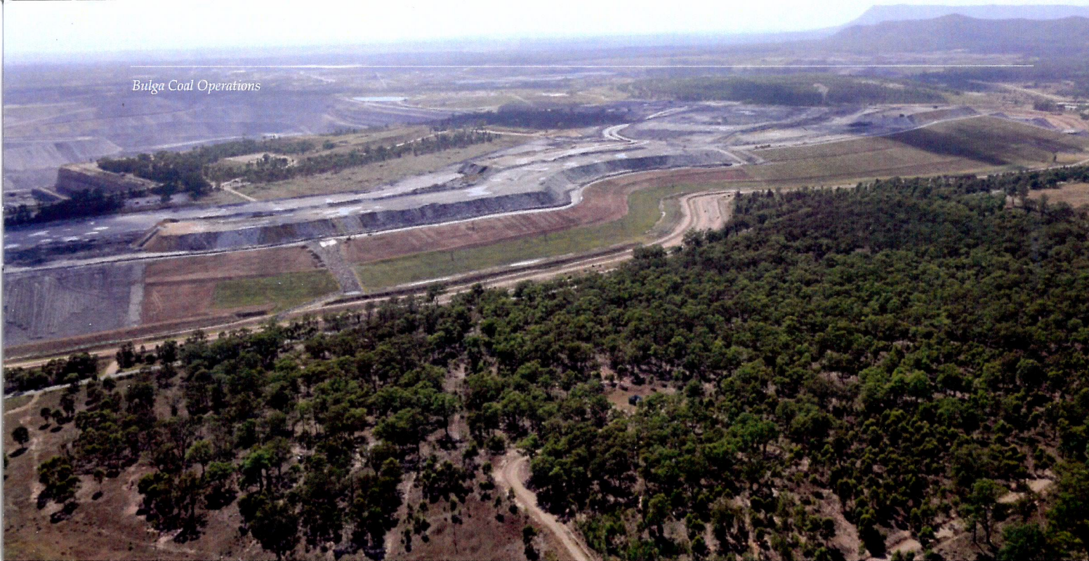
Above and below, progress on the landscaped screen that is minimising noise and visual impacts from our Bulga open cut mine.