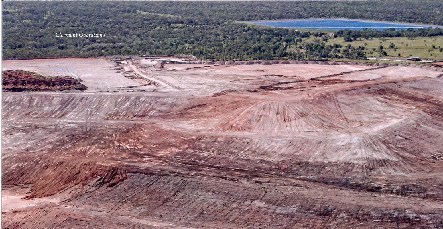
Shaping work (above) on Clermont's Northern West Rock Dump and rehabilitation progress (below).